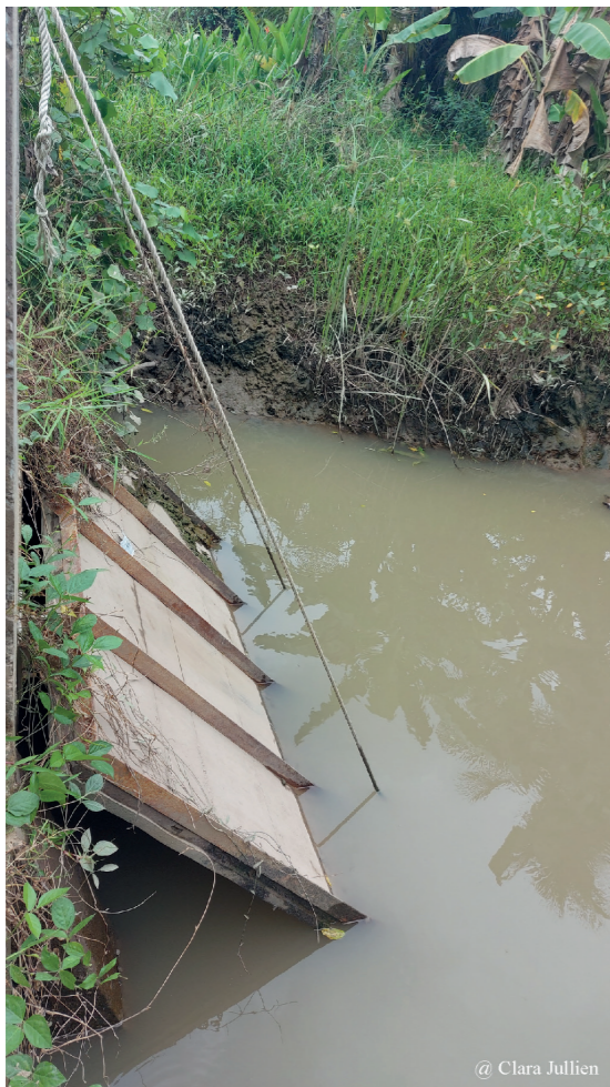
[ Figure 2/7.3 ] Failing public sluiceway in Long Dinh commune, Binh Dai district, Ben Tre province