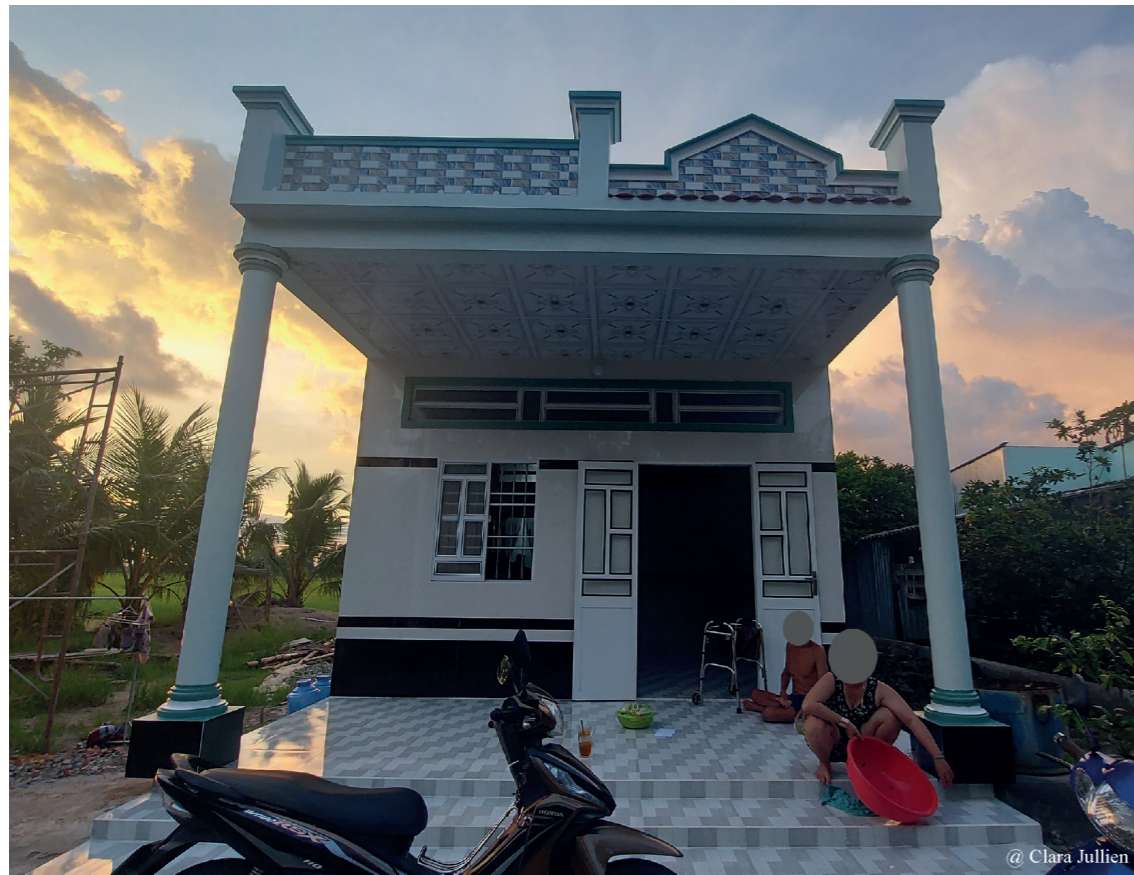
[ Figure 2/7.4 ] A house built by a migrant couple in their forties in Vinh Loi commune, Thanh Tri district, Soc Trang province, using the savings from their work in a factory in Dong Nai province, and borrowed money from relatives. The house is complete, but the couple plans to continue migrating for few more years to pay back their debt and build up a small capital, in order to open a small business in Vinh Loi. They choose to rent out their 3,000 m 2 of farmland instead of farming it as the land surface is small.

Photo credit: ©Clara Jullien - 17/06/2022