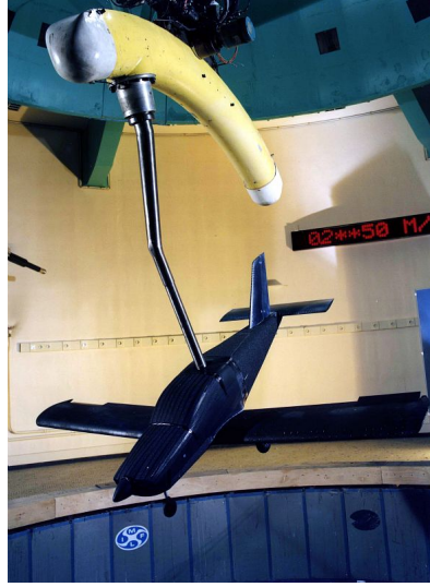
FIGURE 1 – Picture of the light aircraft scale model fixed on the rotary balance in the vertical wind tunnel of ONERA Lille.