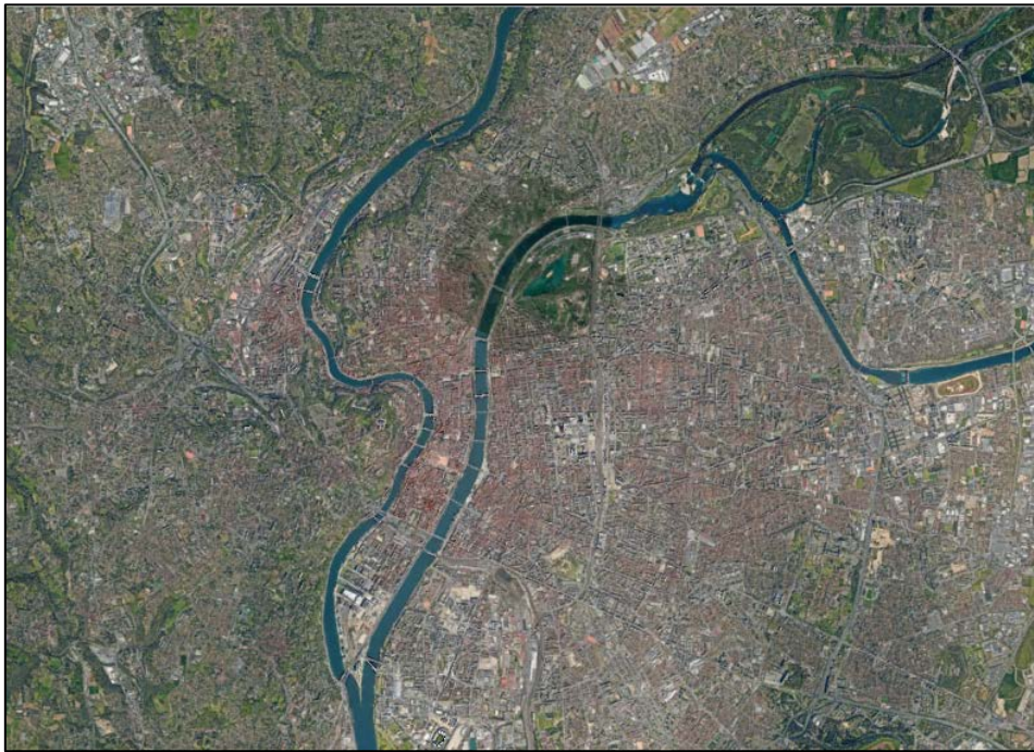
Figure 1: Lyon, a city crossed by two water courses: Saône river (left) & Rhône river (right)

The territory of Lyon is marked by water. The valley is crossed by two major rivers (the Rhône and Saône) which meet south of the city (Fig1). Various groundwater aquifers occupy the eastern part of the plain, including an alluvial aquifer used for drinking water supply. The hills are crossed by an important network of small rivers and streams.