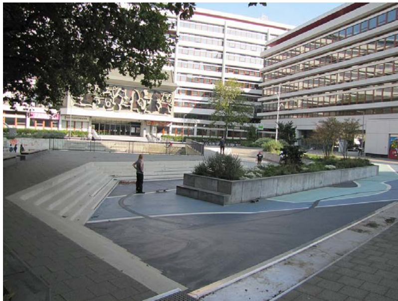
Figure 4: Bentheplein water square in Rotterdam created in 2013 for the rainwater management

Part of the city (historic commercial district, port) remains vulnerable because it is located outside the ring dikes. In addition, the city centre is particularly sensitive to storm rainfall because the ground has been completely waterproofed and there is no possibility of creating storage capacity on public space 14 .