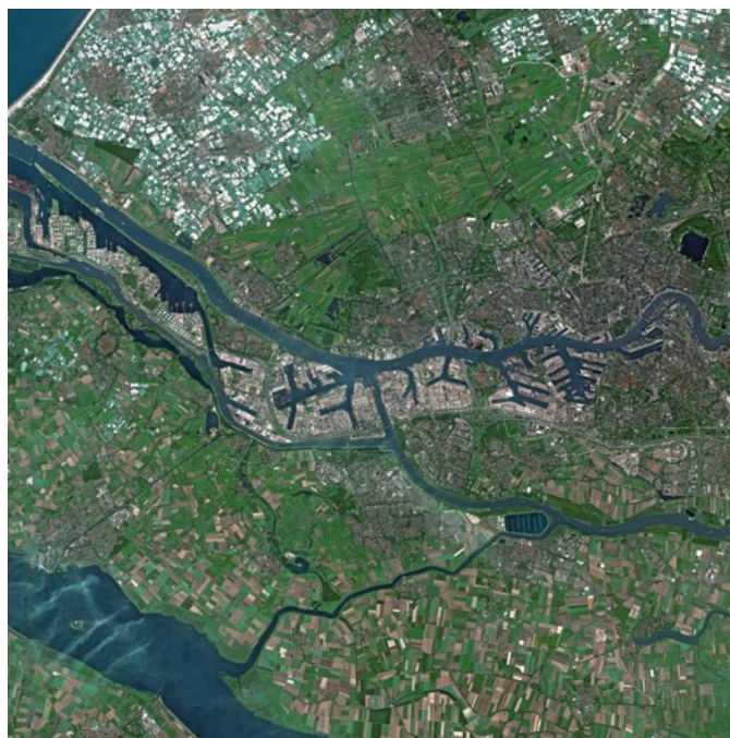
Figure 3: Rotterdam, a city where water plays an important role

Although flood risk management policy in Holland remains dominated by structural measures (reflecting a strong technical culture), new modes of action are emerging under the influence of sustainable development issues and the emergence of the concept of resilience in the field of natural hazards. It is in this context that programs such as "room for the river", "building with nature", "flood proof housing" appear. In addition, despite the trust placed in the protective structures, the authorities are now studying the mechanisms of dam failure and their consequences (in terms of damage to property and persons, in terms of population evacuation) 12 . The example of Rotterdam, with its flood risk management policy based on taking climate change into account in practices, is a perfect illustration of these recent transformations.