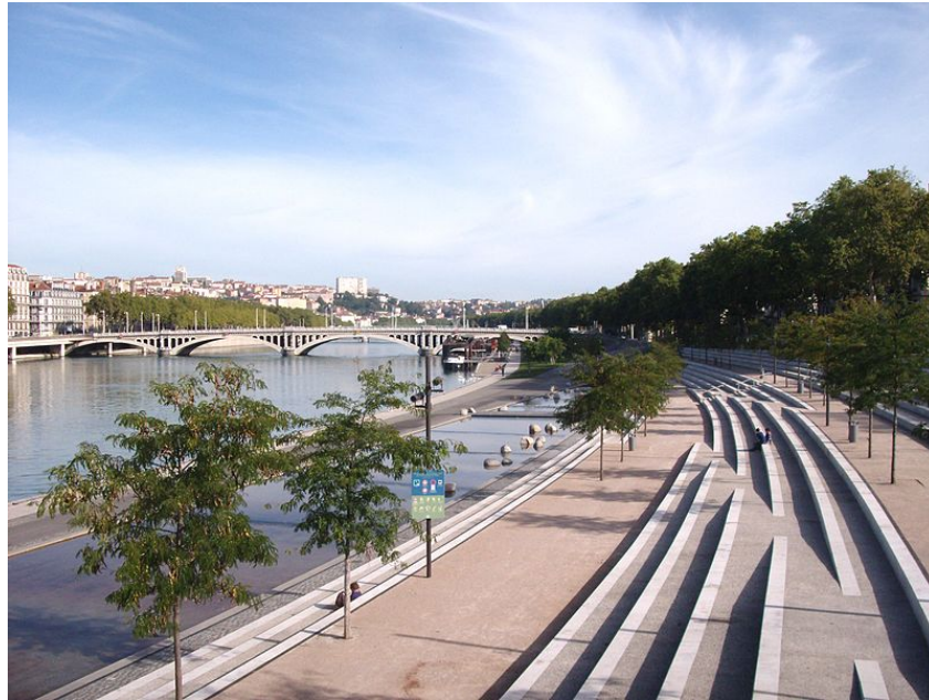
Fig 2: The banks of the Rhône in Lyon redeveloped in the mid-2000s to become public space

The operation is a success that is reflected in increased public use of the banks; it will also require the rehabilitation of the cleaning and waste management service (creation of a specific service).