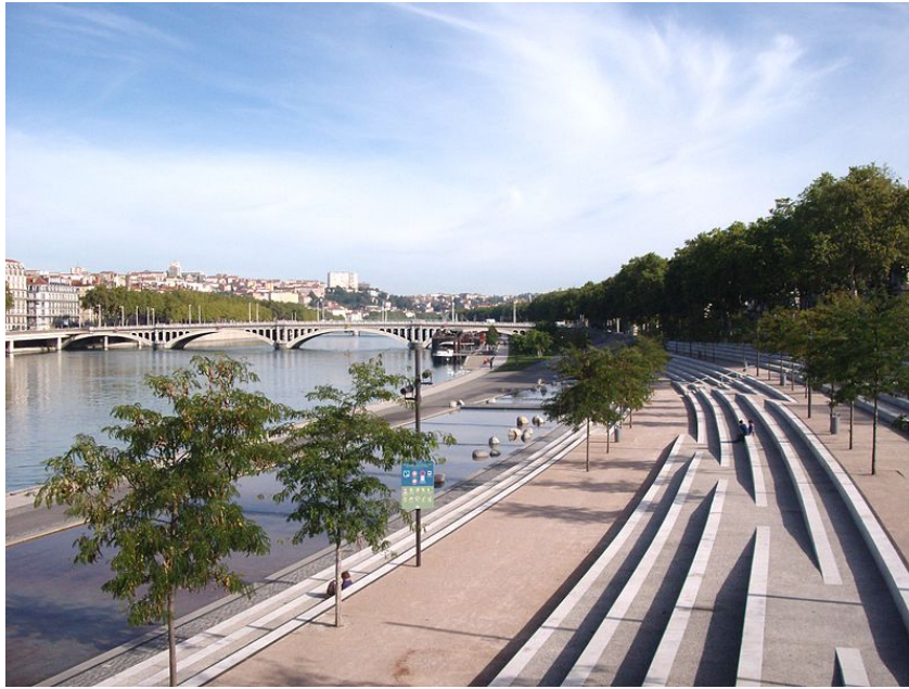
Fig 2: The banks of the Rhône in Lyon redeveloped in the mid-2000s to become public space

The operation is a success that is reflected in increased public use of the banks; it will also require the rehabilitation of the cleaning and waste management service (creation of a specific service).