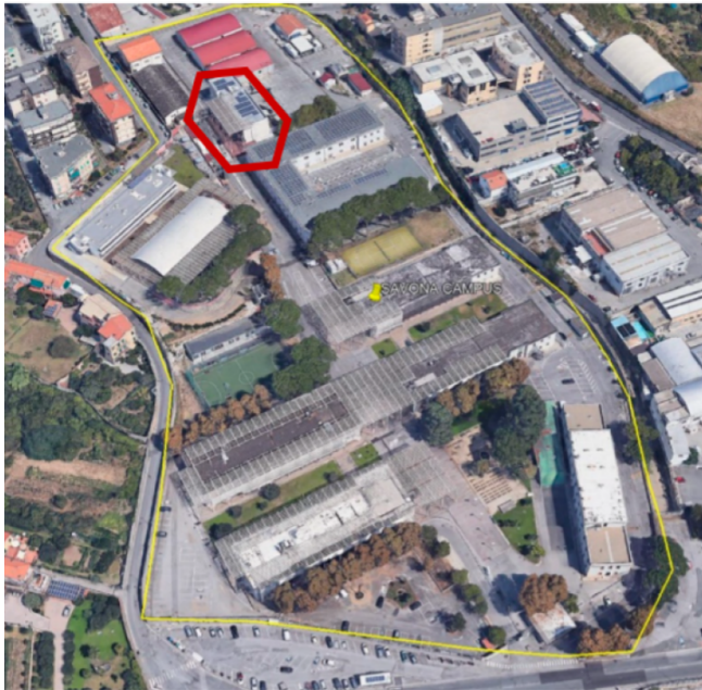
FIGURE 1. The Savona Campus and the Zero-Emission Building (in red).

solar panels and gas turbines, and their production partially supplies the internal energy demand.