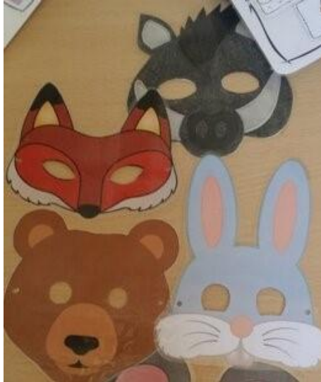
Figure 4.7. Masks

These masks were offered by the teacher of one of the two classes at the end of the course.