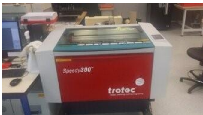
Figure 4.8. The laser cutter

This school trip was the opportunity to participate in a workshop on coding (with beebots) to understand the communication between the computer and the laser cutter.