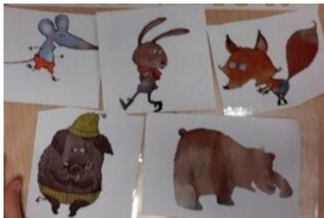
Figure 4.2. Flashcards of the characters of La Moufle [Illustrations from La Moufle , Cécile Hudrisier © Editions Didier Jeunesse, 2009]

- Flashcards / illustrations representing each character: