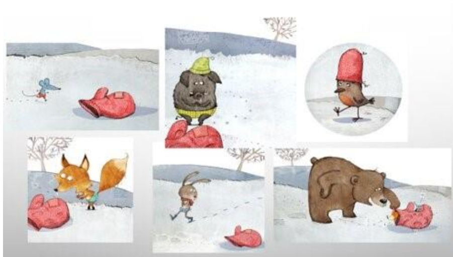
Figure 4.1. Sequential images from the story La Moufle (The Mitten)

These sequential images, stand-alone objects that pupils can physically handle and place where they wish, were used to enable the pupils to reconstruct the chronology of the story. Although they can be of interest, used individually, in this learning situation, they were envisaged as only making sense when linked together.