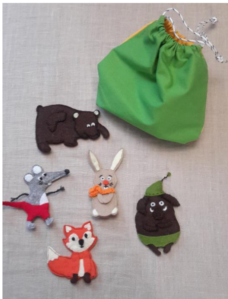
Figure 4.6. Felt figurine, fingerplay