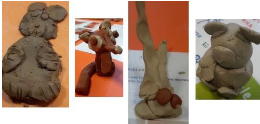
Figure 4.9. Pupils' creations

Despite all the group preparation done in advance, it was only during the sessions with the pupils that the probationers discovered certain problems. They had, for example, not anticipated the difficulty related to the choice of and its handling: for clay to be malleable, it is actually necessary to add water to it. Incidentally it should also be noted that there are no colors on these objects and therefore the shape is of prime importance to the representation and identification of the animal. On this point, the pupils themselves took the initiative in creating figures of different sizes to take into account this characteristic which may have seemed relevant to them, but which had not been mentioned by the probationers on their guidance sheet. There is a very interesting implication here on the part of the pupils, an implication which testifies to an instrumental genesis at the level of the pupils themselves. Despite the unforeseen problems, the pupils still made a success of the workshop, which was particularly important, given the fact that the model thus created served as a learning object in the next activity.