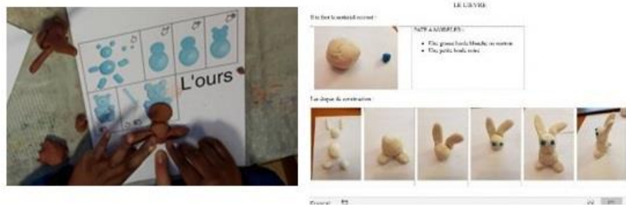
Figure 4.3. Clay and guidance sheet to create the characters in La Moufle / The Mitten [Illustrations from La Moufle, Cécile Hudrisier © Editions Didier Jeunesse, 2009]