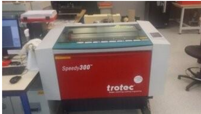
Figure 4.8. The laser cutter

This school trip was the opportunity to participate in a workshop on coding (with beebots) to understand the communication between the computer and the laser cutter.