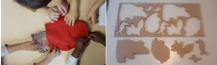
Figure 4.5. Felt mitten and wooden figures

These objects were made at FabLangevin . These marottes were vectorized and then cut out using a laser cutter.