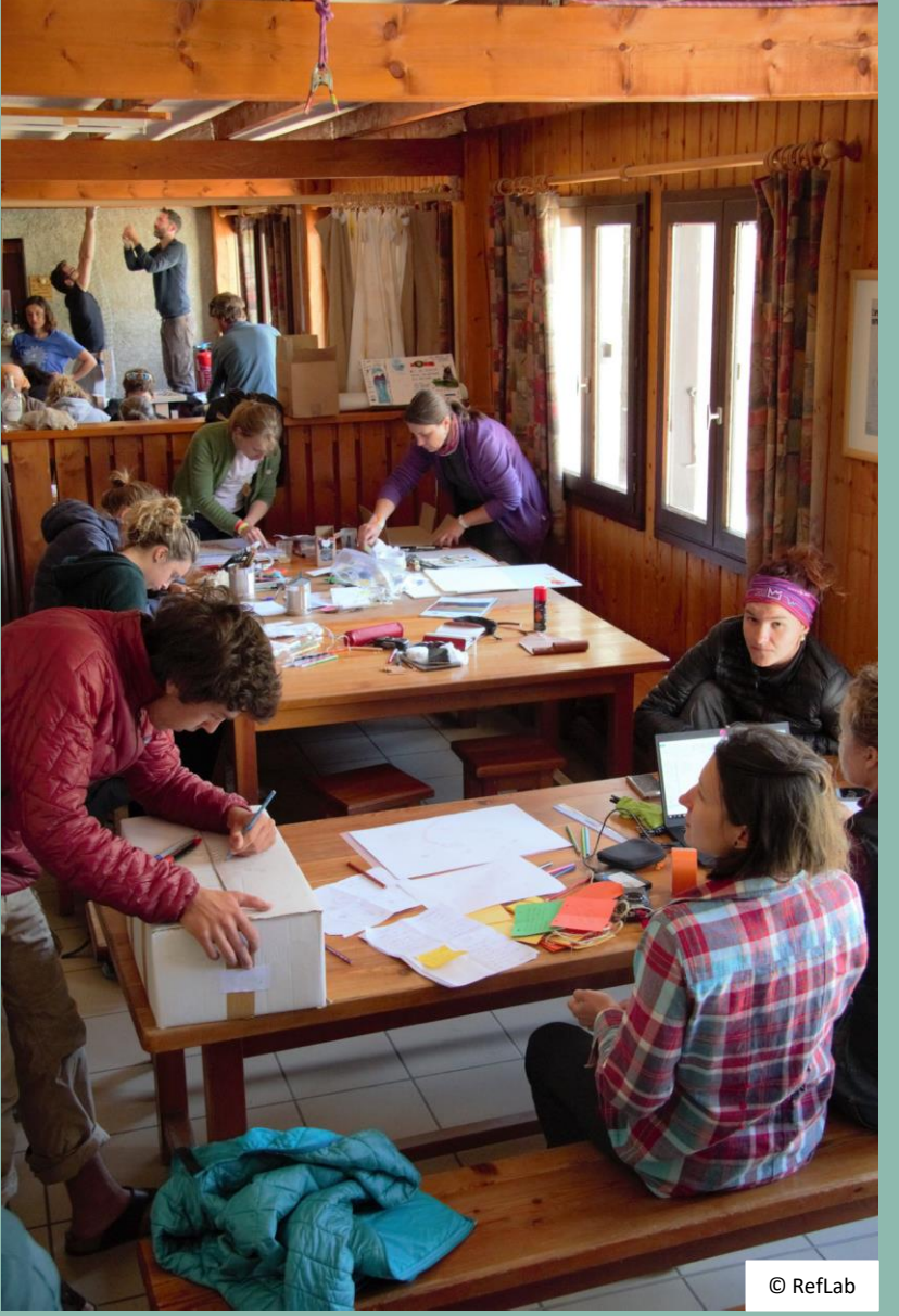
Illustration 3 : Refuge Remix