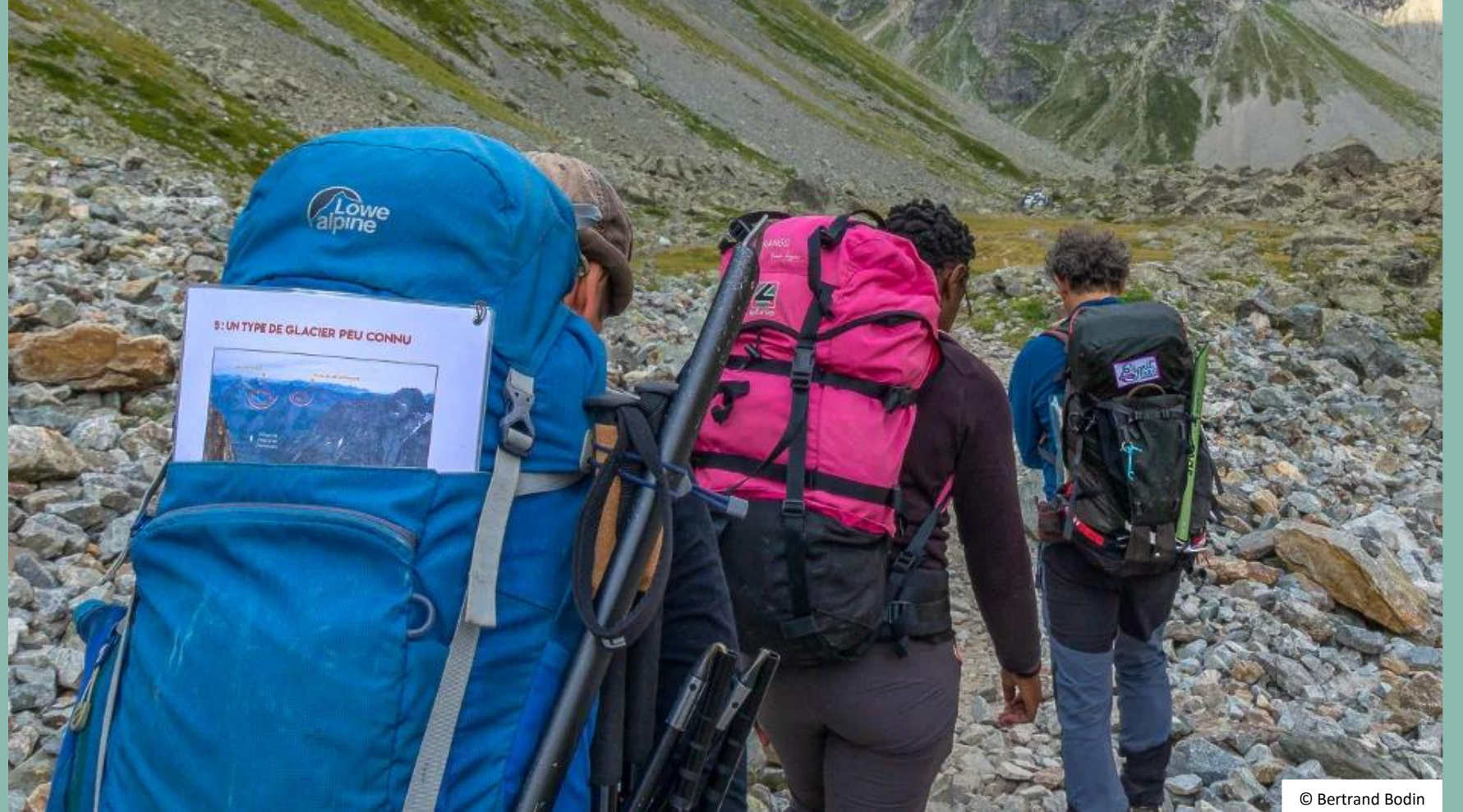
Illustration 1 : Itinerary in Sentinel Huts, a scientific hiking

“this idea of a scientific itinerancy, it's the idea of understanding something, not just thinking that it's beautiful” (a participant of the Itinerary in Sentinel Huts)