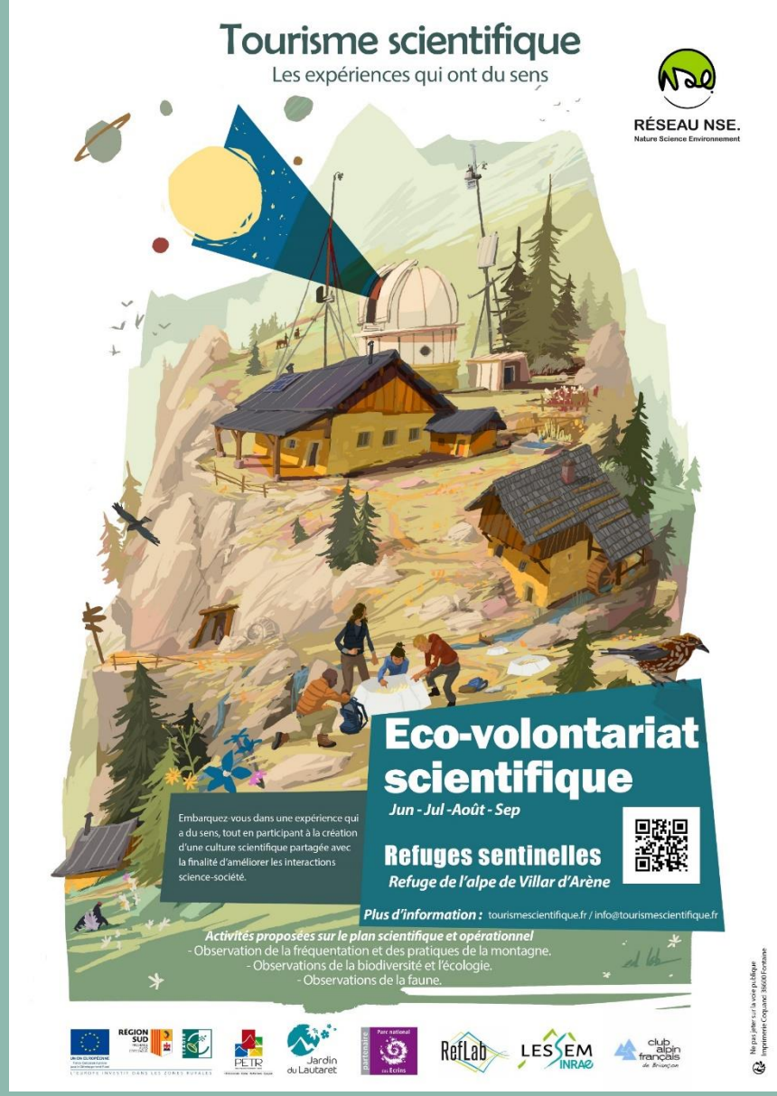
Illustration 2 : Scientific Eco-volunteering in Sentinel Huts