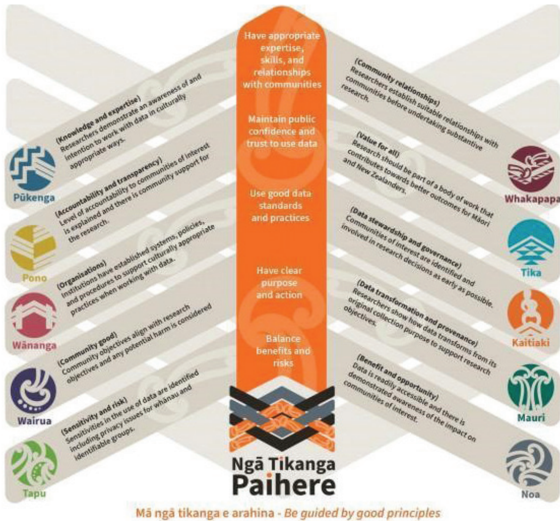
Figure 3. The Ngā Tikanga Paihere guidelines (Stats NZ, 2020, p. 10)