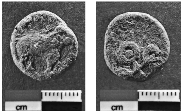
Fig. 3 – Satavahana coin from Berenike (Sidebotham et al. 2019, pl. XXII).

The lead coin is an issue of the Satavahanas, originating from the Krishna-Bheema basin in the Deccan and dated to ca the 2nd century AD ( fig. 3 ). 5 Comparable coins have been reported from the excavations at the sites of Kondapur and Sannati. The obverse has an elephant and a partly preserved inscription ... Siri Satakanisa while the reverse had an Ujjain symbol. It was, most likely, struck by Vasithiputa Siri Satakani, or Gotamiputa Siri Yajna Satakani, but with a shortened version of the king's name.