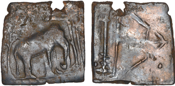
Fig. 1 – Chera dynasty coin found in Dios (T. Faucher/MAFDO).