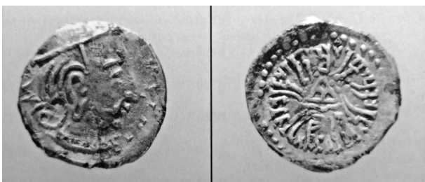
Fig. 2 – King Rudrasena III coin from Berenike (Sidebotham, Wendrich 2007, p. 209, no. 115).

We know about export of coins from Egypt to India sent as batches of cargo, 3 but a lot less about coins from India coming through Egypt. The only other archaeologically documented instances of Indian coins found in the Eastern Desert, prior to this report, come from Berenike. Two Indian coins, one in silver and one in lead, have been reported as found during excavations at this important port of trade. The first in silver is a typical western Kshatrapa coin, issued by the king Rudrasena III (fig. 2). 4