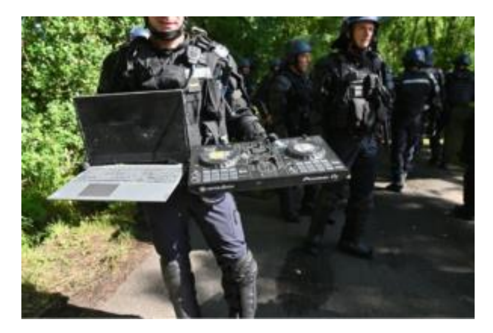
Pic 9 DJ equipment reported as a 'seizure' by the police (from the Ministry of the Home Affairs official Twitter account).

the police, and at least for one of them, in addition to the use of the usual police arsenal, the destruction of sound equipment, turntables and records was noted. [12]