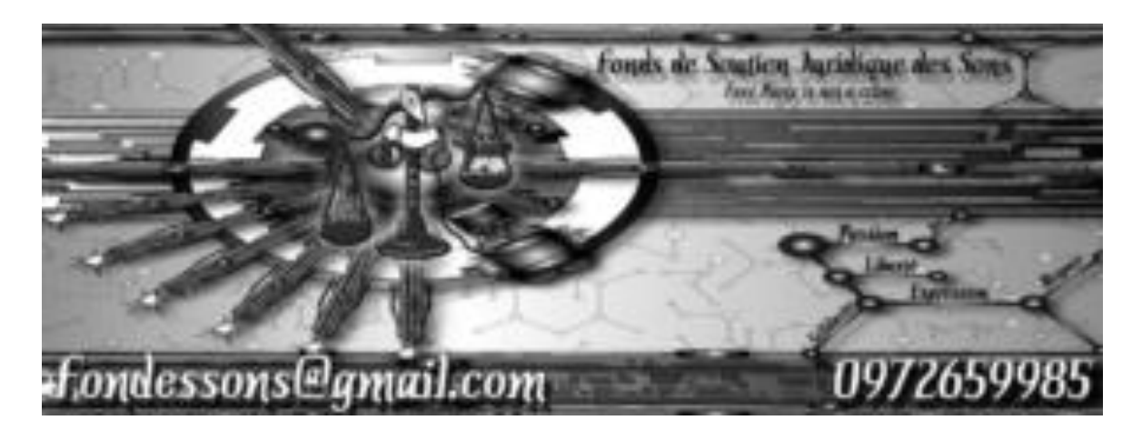
Pic 8 Flyer for the 'Fonds de Soutien Juridique des Sons' (legal support fund for sound systems)

The large illegal teknival organized on May 1st, 2016 explicitly addressed the increasingly frequent seizures of sound systems. Around the mid-2010s tekno sound systems becoming more organized around a "fond de soutien juridique des sons" (legal support fund for sound systems, see pic 8). Established in 2014, the fund is crowdfunded to cover the legal costs to oppose sound systems confiscation. An ethics committee reviews the case and offers support when the seizure is deemed to be abusive. The committee also verifies "that the organizers requesting support are not at fault, that they respect the site and nature". When the support fund gets involved, the sound system is usually returned. [11]