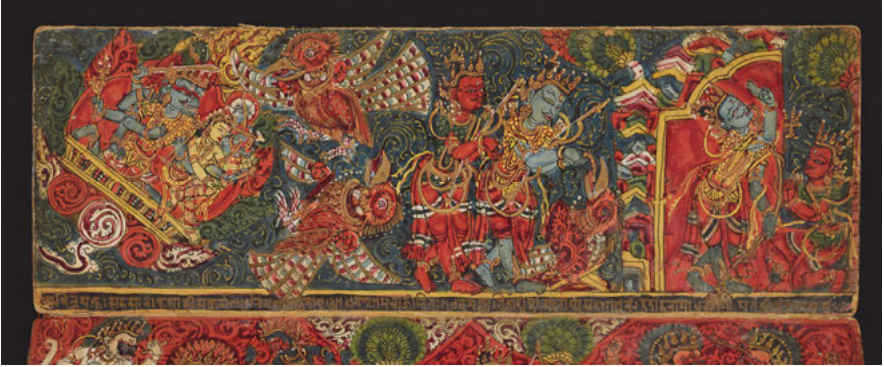
Fig. 12: The episode of Jaṭāyu, Add.864, page 77.

Only page 78 is dedicated to the fourth book, the Kiṣkindhākāṇḍa , to its most central and dramatic events: the alliance between Rāma and Sugrīva sealed by Hanumān; and the duel between Sugrīva and his elder brother Bali, won by the former only thanks to the help of Rāma who deceitfully shoots Bali with his arrow while he is wrestling with his younger brother (Fig. 13). 33 Pages 79 to 83 depict