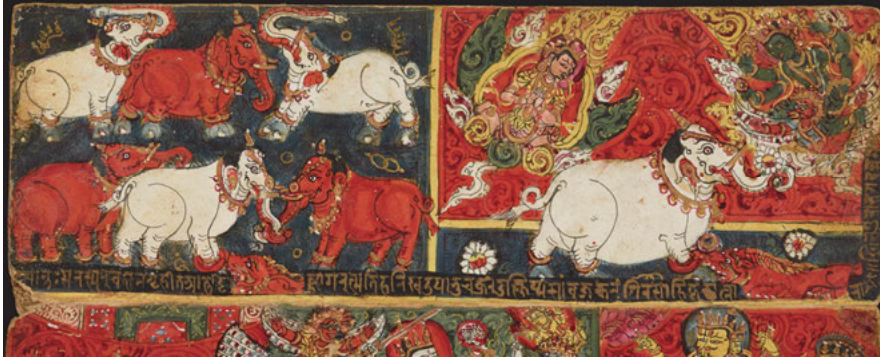
Fig. 20: gajendramokṣa , Add. 864, page 131.

defeats the gigantic elephant Kuvalayapīḍa; on the right, while a number of wrestlers (?) are engaged in an acrobatic feat, Kṛṣṇa defeats, and dances over, his evil uncle Kāṁsa, 43 in front of his warriors and, probably, his wife. 44