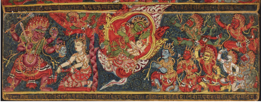
Fig. 14: Illusionary Hero and Heroine, Add.864, page 88.

The first page of this long sequence (84) represents the well-known episode of the setubandha , the construction of the bridge that joins Bhārata to Laṅkā: Rāma, Lakṣmaṇa, Vibhīṣaṇa and the monkey army are about to cross the ocean, while Rāvaṇa is represented flying in his vimāna on the other side of the body of water that is being bridged by the causeway (84). The page that closes the story of the Rāmāyaṇa (104) depicts Rāma's lavish royal consecration ceremony in Ayodhyā. Two Brahmins (one of them should be the great ṛṣi Vasiṣṭha) are pouring water over Rāma and Sītā, while Lakṣmaṇa, Hanumān and other monkeys surround them. 35