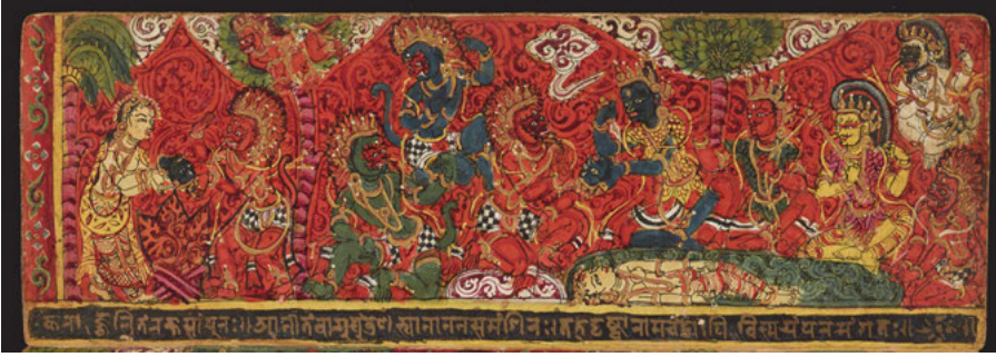
Fig. 15: Illusions revealed, Add.864, page 89.

green demon, but Indrajit himself who conjures up the illusory Sitā and slaughters her in front of his enemies. Furthermore, what is crucially missing in the version of the critical edition is the connection between the two episodes based on the double-edged power of māyā . By juxtaposing the two episodes, the artist (or the version he follows) manages to have the magic power of the Rākṣasas defeat itself in a cunning twist in the plot: it is by the very illusory head of Rāma, brought to his attention by Hanumān, that Rāma realizes the trick, overcomes his dependency and is now ready to fight again.