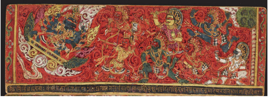
Fig. 16: Rāvaṇa strikes back, Add. 864, page 93.

It is interesting to remark that, after the long sequence of the Rāmāyaṇa , the remaining forty or so pages of the accordion book are occupied by a plurality of other themes in which the sequential order of the scenes seems to lose the centrality that it had in the four narrative pieces that occupy the first hundred pages of the manuscript. No general, explicit pronouncement can be made at this stage of the research on the significance of this overall organization. For the time being, before trying to draw some tentative general conclusions, a sheer description of the remaining pages will have to suffice.