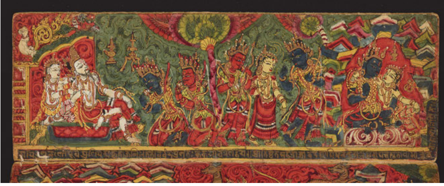
Fig. 11: Rāmāyaṇa 's opening scene, Add.864, page 75.