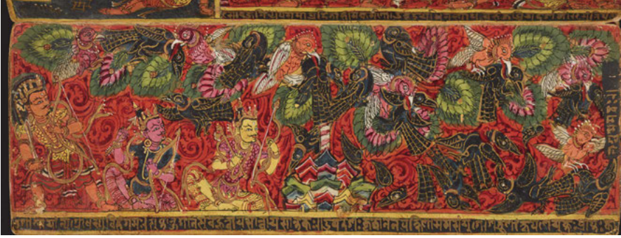
Fig. 10: The owl and the crows, Add.864, page 44.