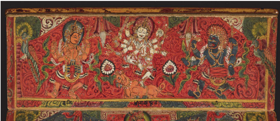
Fig. 2: Dancing Śiva with attendants, Add.864, page 73.

In order to try and unveil the rationale of the choice of scenes and their sequence, with the final aim of better understanding the purpose of the artwork as a whole, the very first task is simply to determine where the manuscript starts, and hence which side is the recto of the accordion book and which is the verso. Pal starts his study by assuming that what is now digitised as page 73 is the beginning of the artwork (see Fig. 2). He writes that ‘the illustrations begin with a hieratic representation of a multi-armed Śiva dancing on his bull and attended by two companions. The lighter figure on Śiva’s right is identified as Nandi, but the inscription below the dark and fierce-looking figure to Śiva’s left is illegible. But there is little doubt that it is Mahākāla, one of the many pratihāras [“guardians”] of Śiva.’