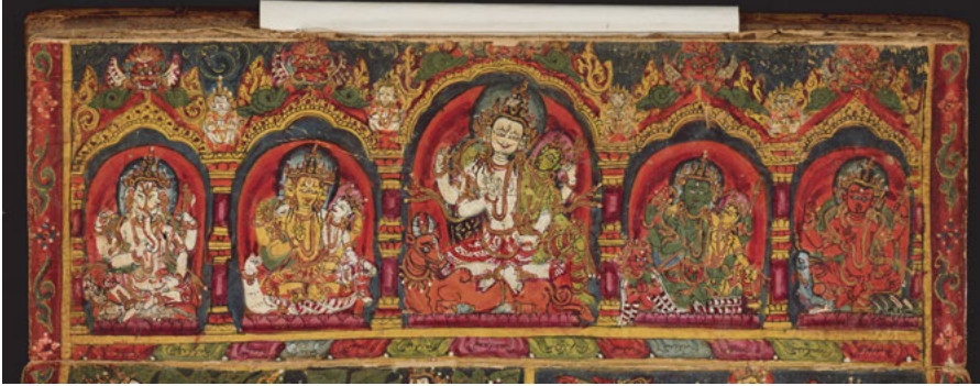
Fig. 3: The Opening Scene, Add.864, page 1.

However, I would argue that the hints given by the general structure of the narrative sequences seem to point at what is now digitised as page 1 as the actual opening scene (see Fig. 3). That is an auspicious representation of five deities with their respective consorts and mythical vehicles ( vāhanas ), seated in five niches in a sort of highly decorated arched porch, probably representing a royal palace or a royal hall within a palace. In the middle, we find Śiva with Umā, on Nāndin, here clearly represented as the main deities insofar as they are depicted in the centre and in larger scale than all the other figures in the page. To their right, Brahmā sits with his consort on the Haṃsa. Further to their right, Gaṇeśa sits on the mouse. To their left, Viṣṇu and Lakṣmī sit on Garuda. Further to their left, Skanda sits on the peacock. To have such a complete array of Brahmanical deities in what would otherwise just be the middle of the manuscript seems to me less likely than having the figure of the dancing Śiva with his attendants as the image for the middle of the work, contrary to what Pal seemed to have assumed.