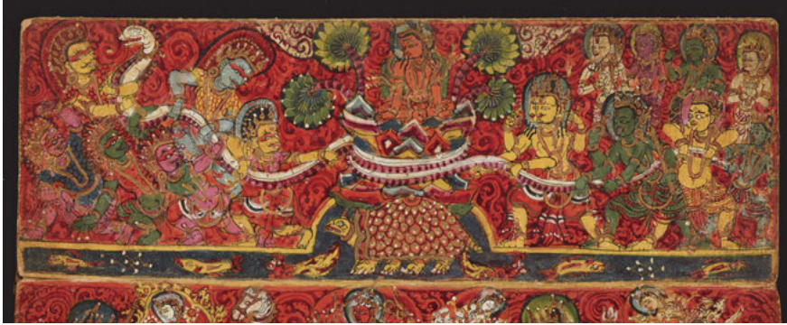
Fig. 5: samudramanathana , Add.864, page 3.

ocean of milk on the part of devas ('gods') and asuras ('demons') and its immediate consequences. As it is clear from the caption on page five, 12 this could also be considered as the beginning of the scenes from the Mahābhārata , the longest narrative sequence in the manuscript, ending with page forty-eight of what I am considering the recto of the accordion book, and therefore practically occupying almost one third of the whole manuscript. Thus, page 3 features the samudramanathana proper (see Fig. 5): the mount Mandara is in the middle functioning as the churning stick, the serpent Vāsuki functions as the rope, while gods and demons are forcefully pulling on the two sides. Pages 4, 5 and 6 represent, respectively, some of the gems ( ratnas ) coming out of the milk ocean including the deadly poison being swiftly drunk by Śiva, the seizing of the amṛta ('the elixir of immortality') on the part of the gods thanks to the intervention of Viṣṇu disguised as the stunning Mohinī, and the final defeat of the demons. 13 In the following forty-two pages the whole story of the Mahābhārata is narrated by way of only representing some crucial events, most probably with a conscious focus