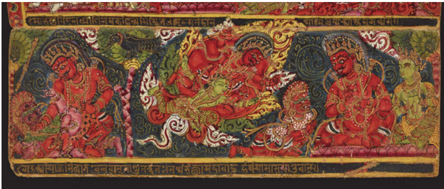
Fig. 8: Hiḍimba defeated and Bhīma’s family, Add.864, page 10.

Page 21 is extremely anomalous (see Fig. 6). The painting is divided in three sub-scenes. To the left, the powerful and menacing forest-dweller Hiḍimba faces the five Pāṇḍava brothers and Draupadī; in the centre, Bhīma fights with him; to the right, Bhīma finally subdues and chokes Hiḍimba. What is utterly surprising about this folio is that this scene seems to be nothing but a repetition of what has already been portrayed in a different fashion between the right subdivision of page 9 (see Fig. 7), in which we see Bhīma wrestling with Hiḍimba, and the left subdivision of page 10 (see Fig. 8), in which we see Hiḍimba subdued by Bhīma. The episode is thus out of sequence here, as the killing of Hiḍimba occurs in the first book and here the story has moved to the second book. The identification of the depicted Rākṣasa as Hiḍimba seems to be safe, as it is based on the Nepālākṣara caption, which closely corresponds to Mahābhārata 1.142.31 18 and mentions the joy of the