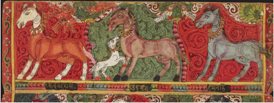
Fig. 18: Random Horses, Add. 864, page 125.

attendants who are throwing arrows at Rākṣasas on the background of a lush forest. The image bears no caption. After the representation of Sūrya, fifteen pages (from 112 to 126) are dedicated to horses of different kinds, often accompanied by captions with their names (see, for instance, Fig. 18, bearing as caption for the three horses the terms ‘ kaṃcukīdoṣa ’ ‘ uturuṃ ’ and ‘ manahi ’, the second one being uncertain as it is hard to read, and all preceded by the siddhi sign). Pal (1967a, 25) connects this section of the manuscript with the Āśvaśāstra , a veterinarian text, and refers: ‘There is a whole manuscript illuminating this text and rendered in the same style in the Palace Museum at Bhaktapur in Nepal. The horses are often labelled in this Cambridge manuscript as in the folios illustrated here [...]’ Nevertheless, I have not been able to locate this manuscript yet. Moreover, the rationale behind the choice of the various horses, their outlines, colours and postures as well as the significance of the names in the captions exceeds the knowledge of the present author. This portion of the manuscript deserves a separate study by an expert of horse husbandry in premodern and early-modern South Asia and Nepal.