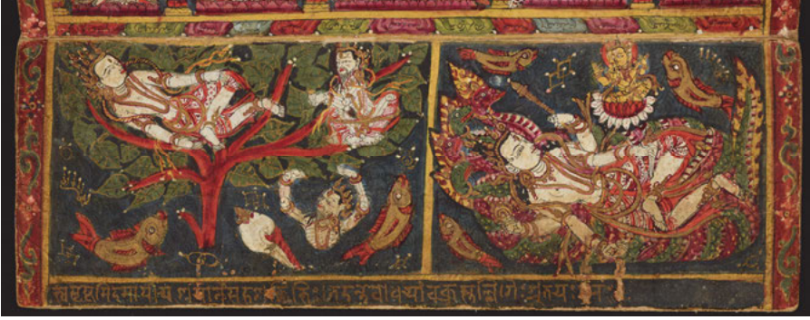
Fig. 4: viṣṇunyangrodhasāyin and śeṣaśayana , Add.864, page 2.

the supreme god and then jubilant in the water after discovering the whole universe in Viṣṇu's mouth. To the right, we find the representation known as yoganidrā , also called śeṣaśayana : Viṣṇu is lying on Ananta, before the manifestation of the entire cosmos, with the 'creator god' Brahmā seated on a lotus coming out of Viṣṇu's navel. Here on the second page one finds the first among the numerous captions in Nepālākṣara characters, which are more often than not drawn from the Sanskrit texts that the various scenes represent. This closely corresponds to verse 12 of the Bhāgavatapurāṇa 10.87, in which both episodes are referred to. 10