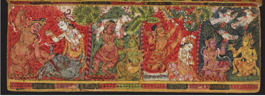
Fig. 17: Four Mahāsiddhas, Add. 864, page 110.

a boar, accompanied by a female partner; Kukkuripā carrying a dog, accompanied by a female attendant; Ghaṇṭāpā dancing with a female partner; and Godhiyāpā with birds and a female partner (Fig. 17). 40 It remains a desideratum to understand the significance of the choice of these particular twenty-one Mahāsiddhas out of the normal list of eighty-four, and to connect — beyond any reasonable, scholarly doubt — their iconographic representations with their names and life stories.