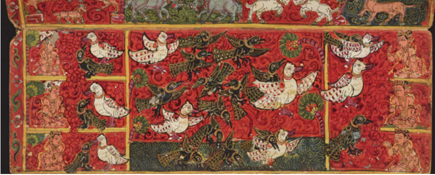
Fig. 19: Mysterious Birds, Add. 864, page 130.

a raven biting its neck arrives before the same man, and again he appears to be instructing them.’ As these images have no caption, I have no further evidence to either support or counter his interpretation.