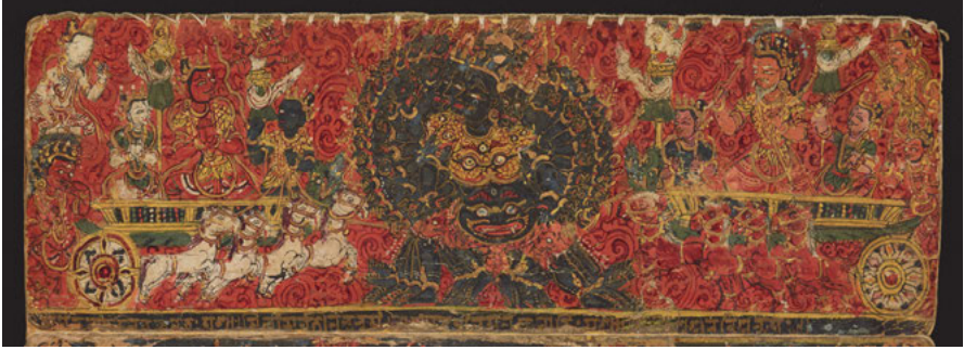
Fig. 9: The viśvarūpadarśana , Add.864, page 35.

never-failing weapon that he intends to use on Arjuna. 20 Pages 32 to 34 depict episodes from the fourth book, the killing of Kīcaka, Virāṭa's lustful marshal, whose very extremities get literally pushed into his trunk by the mighty Bhīma (32); Arjuna is ready to fight and retrieve the cattle that had been raided by the Kauravas (33); and the Pāṇḍava brothers give up their disguise and identify themselves to king Virāṭa (34). Pages 35 and 36 depict episodes from the sixth book: the viśvarūpadarśana , the crucial episode of the Bhagavadgītā (see Fig. 9), 21 and