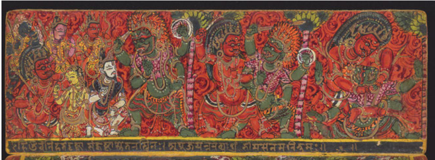
Fig. 6: The 'second Hiḍimba-episode', Add.864, page 21.