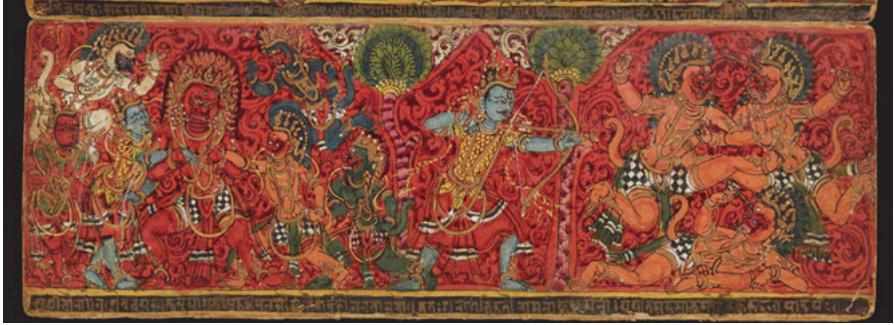
Fig. 13: The killing of Bali, Add.864, page 78.

episodes from the fifth book, the Sundarakāṇḍa . The sequence starts with Hanumān's heroic leap across the ocean, depicted in the moment preceding it, as he is surrounded by other monkeys (79), and it ends with Hanumān's fiery havoc in Lañka and his return back to Rāma, Lakṣmaṇa and the camp of the monkeys in Kiṣkindhā (83). 34