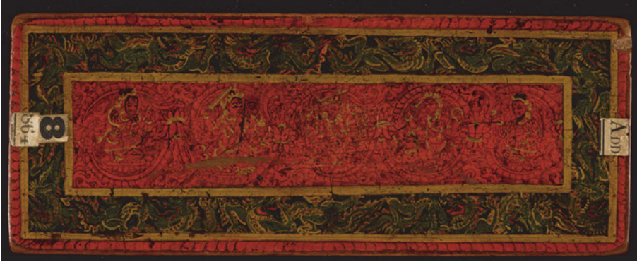
Fig. 1: Wood cover, Add.864.

Their description by Pal is worth quoting in full for the way it highlights the connections between Nepal and Inner Asia: