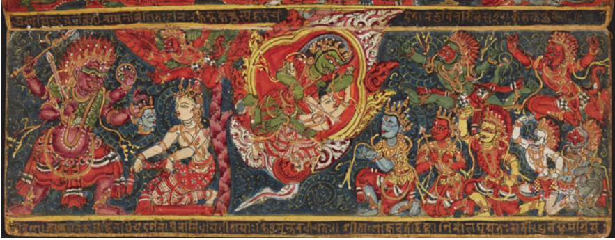
Fig. 14: Illusionary Hero and Heroine, Add.864, page 88.

The first page of this long sequence (84) represents the well-known episode of the setubandha , the construction of the bridge that joins Bhārata to Laṅkā: Rāma, Lakṣmaṇa, Vibhīṣaṇa and the monkey army are about to cross the ocean, while Rāvaṇa is represented flying in his vimāna on the other side of the body of water that is being bridged by the causeway (84). The page that closes the story of the Rāmāyaṇa (104) depicts Rāma's lavish royal consecration ceremony in Ayodhyā. Two Brahmins (one of them should be the great ṛṣi Vasiṣṭha) are pouring water over Rāma and Sītā, while Lakṣmaṇa, Hanumān and other monkeys surround them. 35