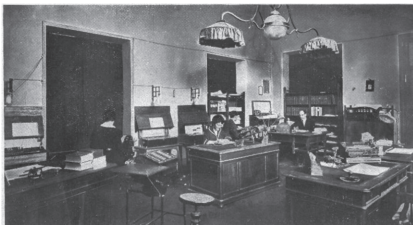
Figure 1. The mechanical calculator room