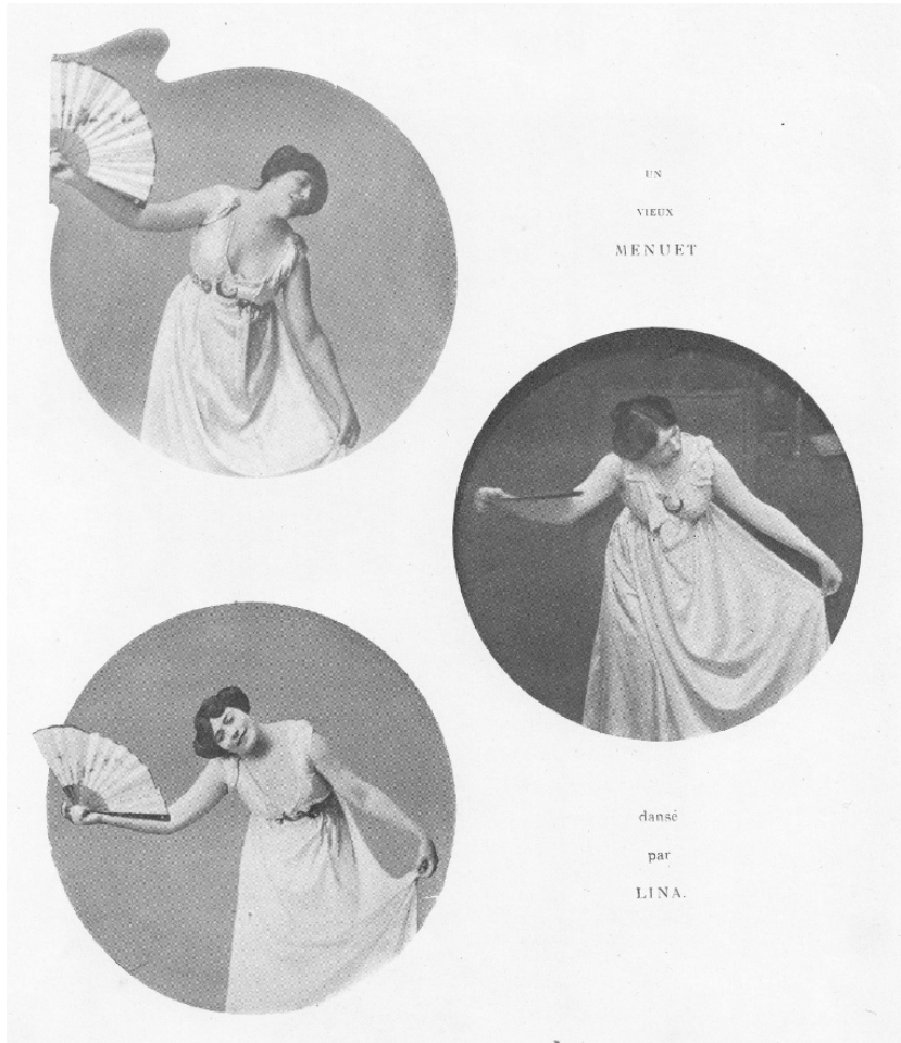
Figure 4.2 Un Vieux menuet dansé par Lina , in Rochas, Les Sentiments , 169 (collection Frigau Manning).

body of the hypnotic subject, while music comes from the singer's body, which restrains itself from making any kind of gesture. Opera, furthermore, provides well-known music for the audiences of the hypnosis sessions. Lina, however, is in a different situation: she is familiar with the famous operatic pieces played during these sessions, but not with the operatic spectacle itself. Last but not least, opera is considered 'objective music' which has a more precise force of suggestion and, according to de