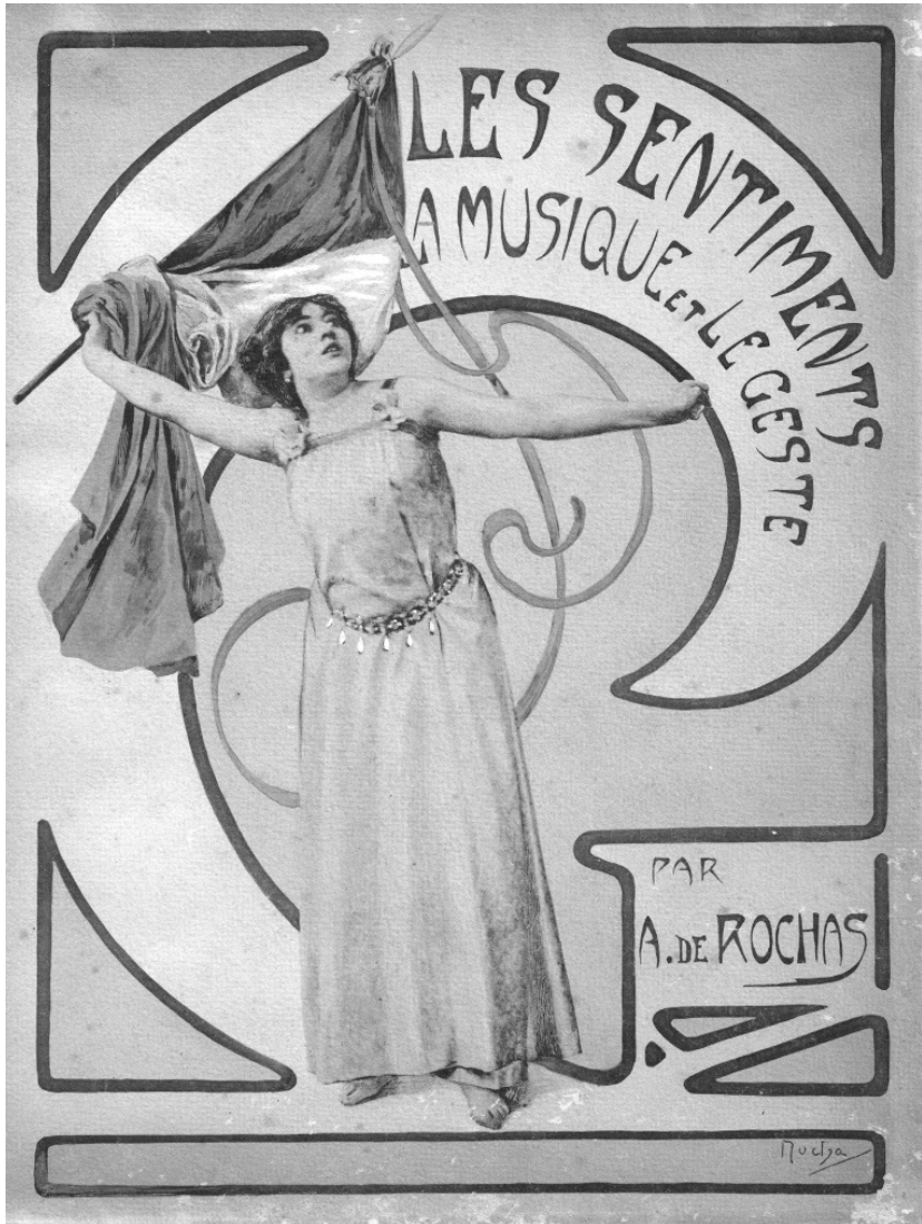
Figure 4.1 Cover illustration for Albert de Rochas, Les Sentiments, la musique et le geste (Grenoble: Librairie Dauphine, 1900).

geste , published in 1900. 21 This book is magnificently illustrated, and features on the cover a portrait by Alfons Mucha of Lina de Ferkel allegorising La Marseillaise (see Figure 4.1), with many other photos of her inside, including some by Nadar.