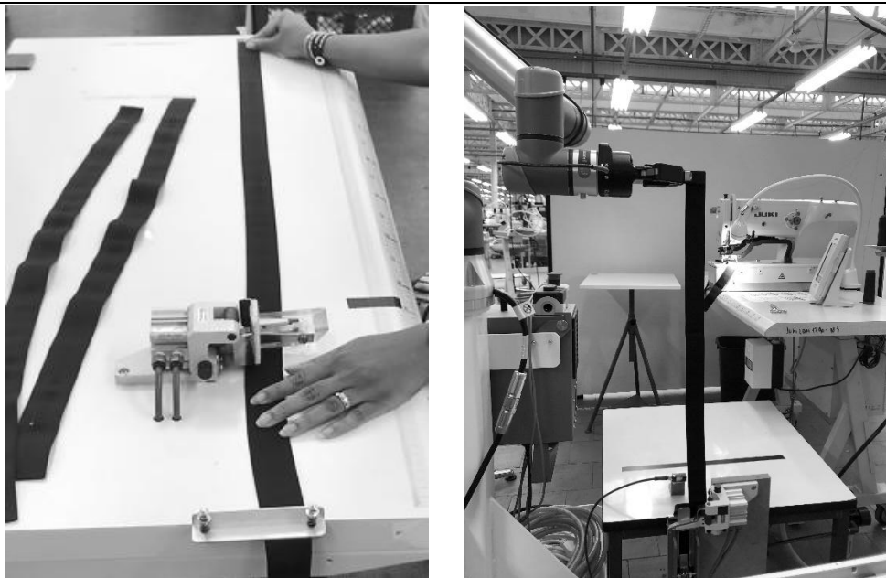
Figure 2. Old cutting station vs automatic cutting station