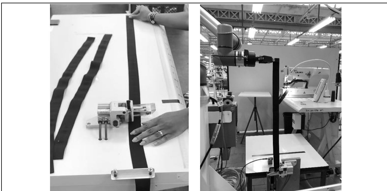
Figure 2. Old cutting station vs automatic cutting station