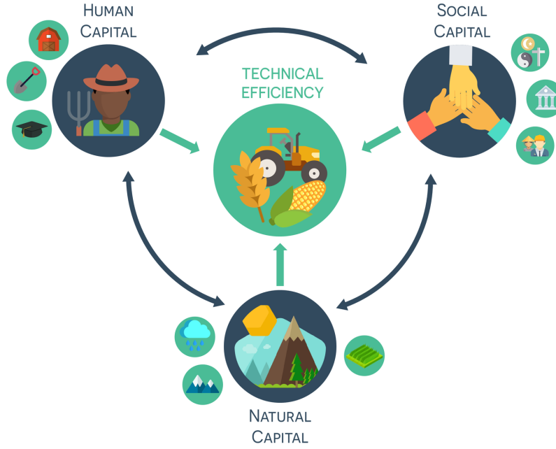
Figure 1: Conceptual framework of interaction impact of three capitals on TE.

Taken together, in this study, we aim to extend this literature on the composite effects of human, natural and social capitals by investigating their impacts on food-crop TE using the meta-analysis data in Sub-Saharan African regions. Figure 1 describes the possible interactions between three groups of capital and their impacts on agricultural TE as discussed above.