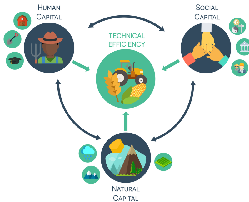
Figure 1: Conceptual framework of interaction impact of three capitals on TE.

Taken together, in this study, we aim to extend this literature on the composite effects of human, natural and social capitals by investigating their impacts on food-crop TE using the meta-analysis data in Sub-Saharan African regions. Figure 1 describes the possible interactions between three groups of capital and their impacts on agricultural TE as discussed above.