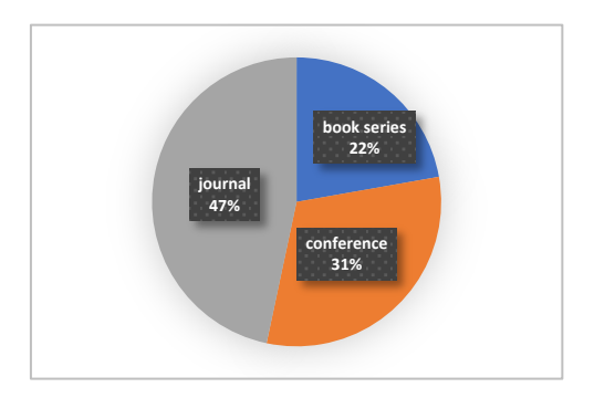
Figure 4. Papers Distribution by Publication Type.

Sources of Papers Publishing on Design and Modelling on Pervasive Systems. One of our goals is to analyze the venues of papers publishing on this specific topic. This question leads us to study the distribution of publications by type of venue: conferences, journals, or workshops, resulting on the distribution presented in Figure 4. Half of the papers are journal papers a quarter are conference ones and the other quarter are papers in book series. There is a quite a good distribution of publication issues and there is no specific issue which can be identified as 'the' issue to publish on modeling in PIS.