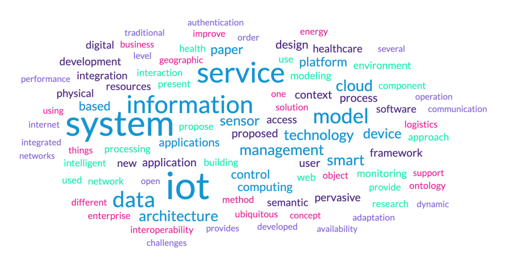
Figure 5. Word cloud

The papers titles, abstracts and keywords contain 195 occurrences of the word "IoT" or "Internet of Things", which put it in the first place before the others. Table 4 shows the frequencies of the most popular words (over 40 occurrences). When looking to less popular words, we can find "design" (28 occurrences) and "modeling" (19 occurrences). "Pervasive" is only present 24 times in the dataset, which means that this specific term is not so used in the literature.