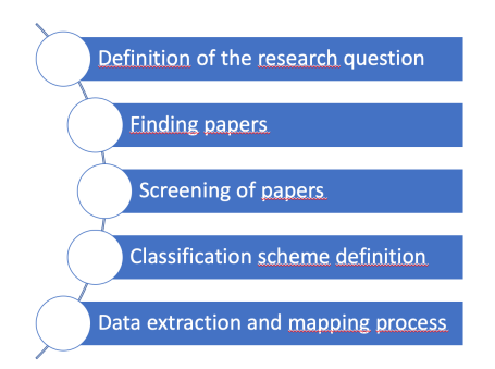
Figure 1. Research process.