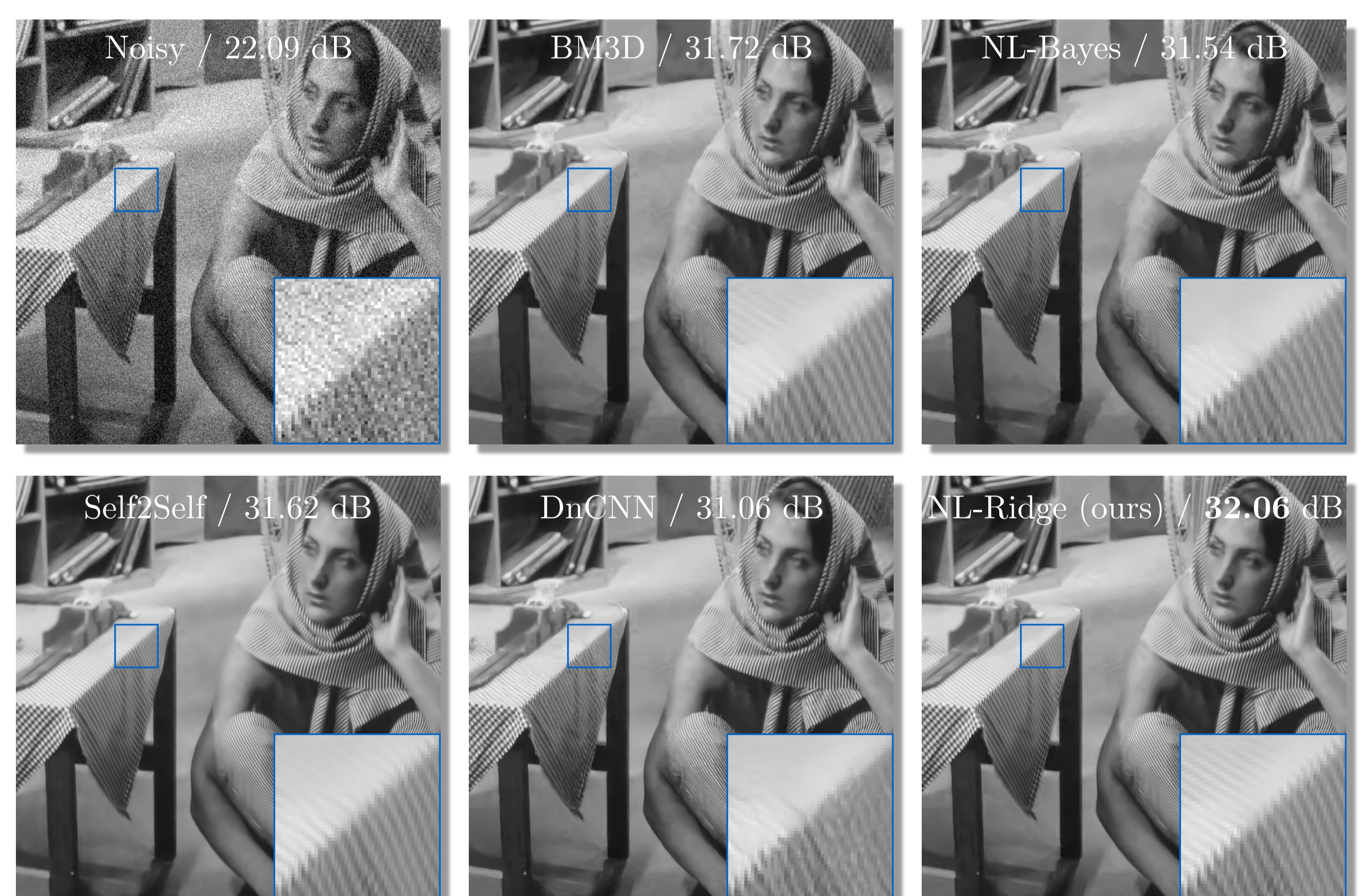
Fig. 2: PSNR results on Barbara corrupted with Gaussian noise ( \sigma = 20 ).