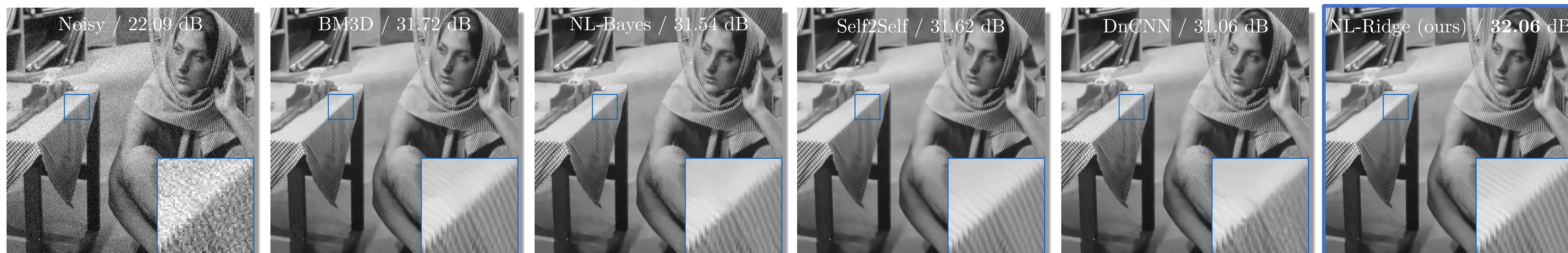
Fig. 1: PSNR results on Barbara corrupted with additive white Gaussian noise ( \sigma = 20 ).