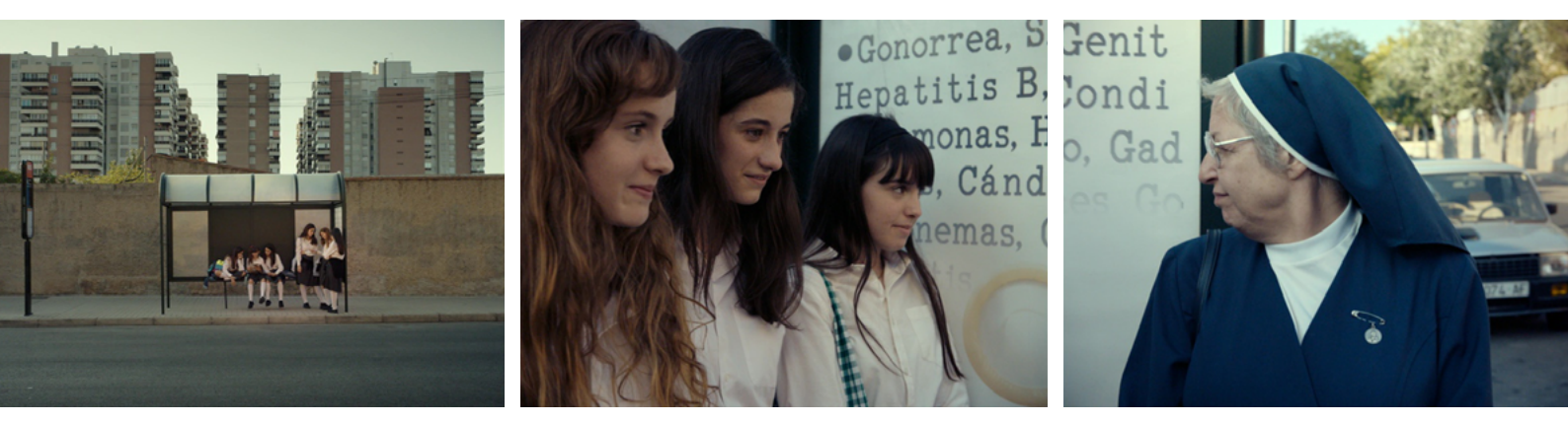
Figure 4. "She was looking more at the poster than at us," says one of the girls

In another sequence involving travelling, when Celia and her mother are on their way to school, her mother tries to talk to her, but their conversation stalls. Inside the car. filmed from behind, mother and daughter are physically close and yet very far apart. Celia insists that she wants to go out to the country with her mother to see their family. At first her mother refuses, but the next day she comes to pick her up early in the morning and takes her in the car. Rugged landscapes loom in the distance on their journey until they reach a deserted town, where her mother introduces her to her family for the first time. On the way home, we see a wide shot of a distant horizon over an empty landscape (Figure 5). Celia is with her mother in the car, in a shot depicting the solitude and vast distance between their lives and the town where her family lives, although the image of the horizon could also suggest hope, openness, and new beginnings (Flécheux, 2014: 20-21).<sup>12</sup> It is a sublime long shot of a remote horizon that also represents the distance between her mother and their family.