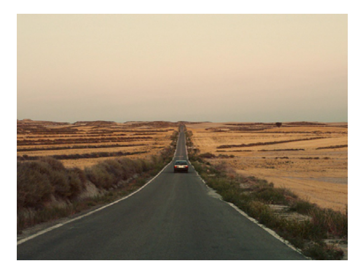
Figura 5. Filming the horizon in Schoolgirls: solitude, distance and openness