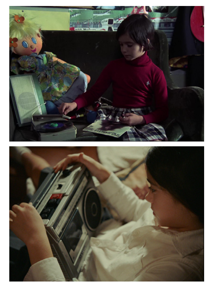
Figure 6. Music in Cría cuervos and in Schoolgirls.

film alludes to different points in time: Celia has recovered the voice she needs to speak about her past, and at the same time to project into the future. The act of singing the song is a performative act involving past, present and future. The song has this dialectical value between multiple moments of Celia's life and creates a resonance with the past in places where she could not express herself freely, such as school. Singing the song is an example of communicative memory, lived memory, defined by Assmann (2008) as a reaction against institutionalised memories. Music in films makes it possible to tell this story of a memory: a communicative, lived memory.<sup>13</sup>