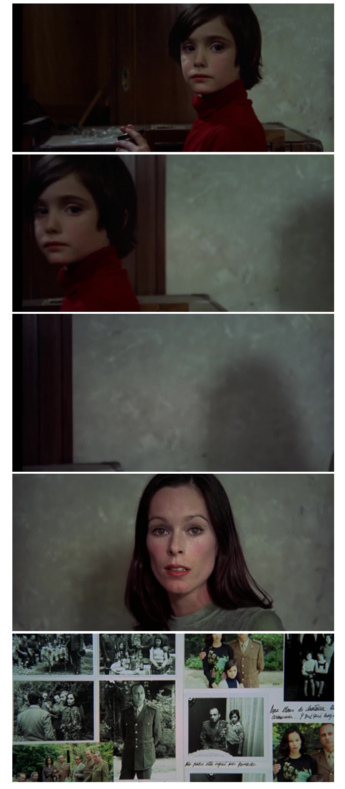
Figure 2. In Cría cuervos (Carlos Saura, 1976), a tracking shot traces a continuous line between Ana the child and Ana the adult. In the latter, the voice and face of the mother (Gerarldine Chaplin) are used to allow the daughter to speak from the future, so that she can express her mother's silenced desires