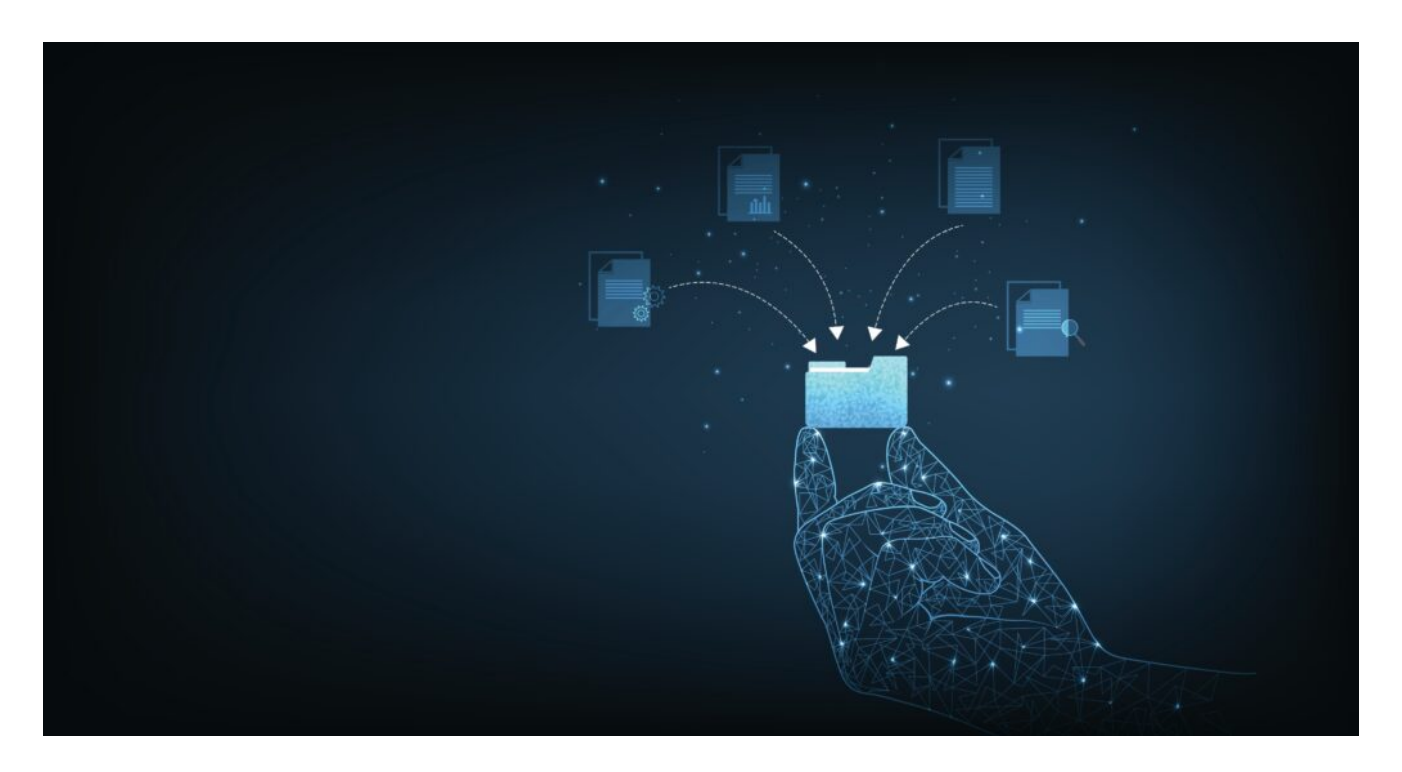
This is part of our campus spotlight on <u>Université Paris 1 Panthéon-Sorbonne, with</u> <u>Columbia University</u>.

E europenowjournal.org/2023/11/20/the-digital-management-of-archaeological-collections-the-vergilius-portal/