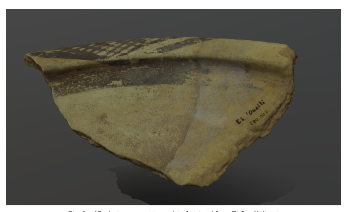
Fig. 2 – 3D photogrammetric model of a sherd from El Oueilli (Iraq)

The collection was first systematically inventoried through a complete photographic coverage. Then, a technological analysis of each sherd was produced through a standardized descriptive form that was filled by students. Finally, a relational database was elaborated to produce a digital atlas of pottery production technologies. We chose FileMaker Pro, which allowed us to create a user-friendly and powerful tool in a few weeks and train students in the principles of relational databases. Thanks to Huma-num , the French national consortium for the digital humanities, the database is already accessible online to project managers and trainee students and partially accessible to the general public.[3] Once completed, it will be totally accessible to the general public and become a teaching and research tool for anybody interested in the issue of ceramic technology in the ancient Near East. To enrich the educational offer on the creation of relational databases in archaeology, I have also launched a YouTube channel related to my teachings, which is currently open to anyone interested in these topics.<sup>[4]</sup>