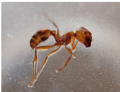
Figure 2. Tropical fire ant worker specimen collected following ant sting on Mayotte Island.

There are five different reactions to ant stings and they are classified with increasing severity as normal, large local, rare, toxic and systemic (anaphylaxis). 5 Normal and local reactions are less severe, while rare, toxic and systemic reactions require specialist medical attention. Anaphylactic reactions are caused by allergenic proteins in the venom that induce immunoglobulin E (IgE) production in people who are allergic to fire ant stings. The onset of anaphylaxis is rapid, with hypersensitivity in multiple body systems mediated by vasodilation, fluid extravasation, smooth muscle contraction and increased mucosal secretions.