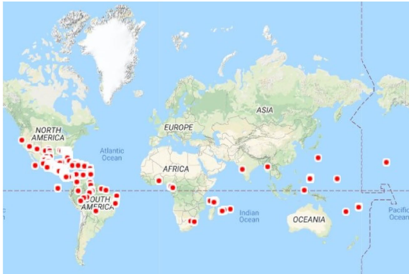
Figure 1. Global distribution of tropical fire ant Solenopsis geminata.

Japan. 4,10–13 This species was recently found for the first time on Mayotte Island, in the Indian Ocean. 13