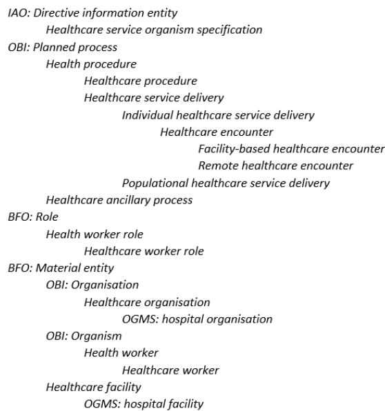
Figure 1 - Taxonomy of the different classes related to healthcare

The taxonomy of the different classes discussed below are presented in figure 1 and their relations in figure 2.