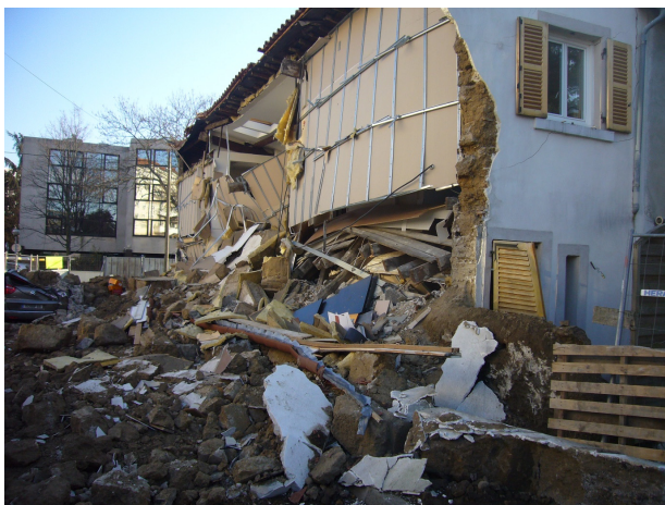
Figure 3. Structural collapse due to inappropriate refurbishment (cement bases, plaster, Rockwool insulation and gypsum board, among others) of a vernacular rammed earth house subjected to water accumulation at the wall base, Lyon, France.

A very limited number of experimental studies have been undertaken to quantify the long-term durability of full-scale buildings exposed to weathering [44]. These studies have confirmed that stabilised earth exhibit lower erosion rates than unstabilised ones. Most importantly, they have shown that the cumulative erosion, measured over several years, is relatively small and may be deemed acceptable even for unstabilised earth structures if one takes into consideration the average service life of buildings.