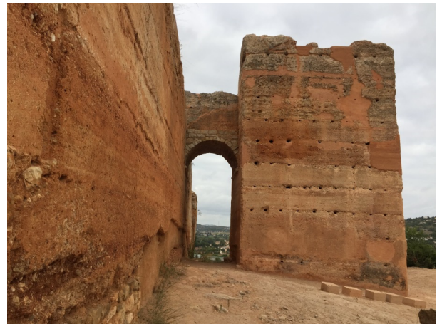
Figure 4. Paderne Castle (12th century) in Algarve, Portugal.