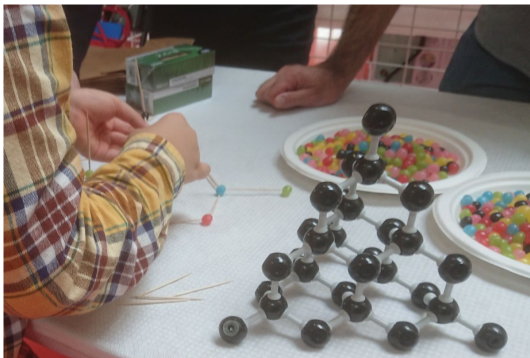
Making a diamond-type crystal model with jelly beans.

Eight years have passed since in 2014 crystallographers world-wide celebrated the International Year of Crystallography at numerous events. It was an excellent opportunity to explain the benefits of crystallography to a wider public from young to old. Since then small-scale public events have continued to take place, especially crystal growth competitions for school kids. In the UK the Big Bang Fair takes place annually, often with events related to crystallography whereas the French equivalent to this Fair is the 'Fête de la Science' or Science Festival, which is held every October with science events all over the country for schoolkids during working days and for all interested people during the weekends.