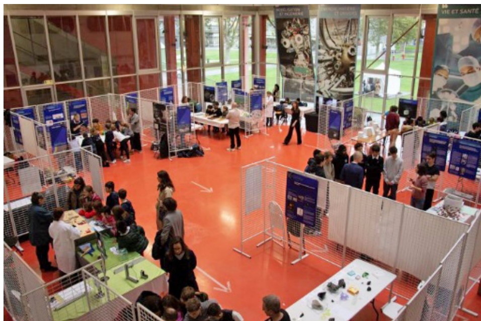
Overview of the Glasses and Minerals event in the Atrium of the Pierre and Marie Curie campus.

These experiences of scientific dissemination and outreach to the wider public remain extremely valuable for both the scientists organizing them and also for the visitors who come to the events and maybe never realized the importance that mineralogy, crystallography and glass science have in their daily life. Fellow mineralogists, crystallographers and glass scientists, do not give up your efforts to present your work to non-scientists!