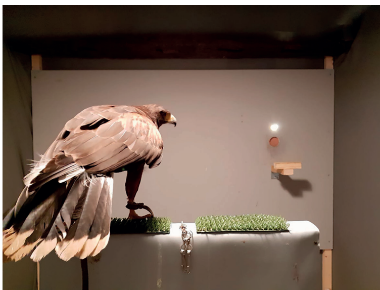
Fig. 1. A female Harris's hawk sitting on the starting perch and making a decision. Note that the bird covers the left stimulus. The hidden hole is just below the visible stimulus.

Experiments were conducted from 10 September 2018 to 11 February 2019. Using operant conditioning and positive reinforcement, we trained each bird individually to discriminate between the constant light as the rewarded stimulus and the flickering light as the unrewarded stimulus (see Boström et al., 2017, for similar procedure). Initially, we trained the bird to fly from the starting perch to the perch in front of the constant light (Fig. 1). During the first 2 days, the food reward was visible and two constant light stimuli were presented, to train the bird to fly to a randomly chosen perch. Then, we started the training with one constant and one flickering light. If the bird made a correct choice and flew to the side presenting the constant light, it received a food reward (a piece of chicken, less than 2 g). If the bird flew to the simultaneously presented lamp flickering at 10 or 20 Hz, it did not receive a reward. The sides of the rewarded and unrewarded stimuli were changed in a pseudo-random order (i.e. the positive stimulus was not presented on the same side for more than three consecutive trials). Thus, during a session of 30 trials, the rewarded stimulus was presented 15 times on each side. When a bird reached 80% correct choices in two