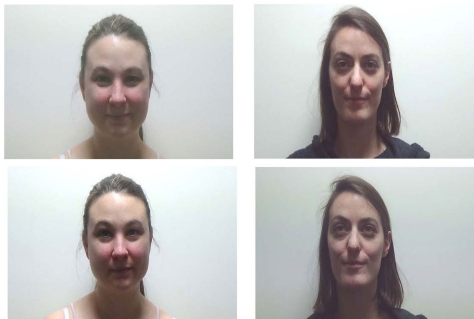
Figure 1. Examples of the stimuli presented: women with a direct gaze (on the top) versus a faraway gaze (on the bottom).

During the familiarization phase (i.e., lasting for 75 seconds), an experimenter, unaware of the face presented, pressed and held a key button on a computer keyboard when the infant looked at the screen and released it when the infant looked away. A computer program recorded the accumulated looking times. During the test phase, the experimenter proceeded in the same way, but when newborns looked away from the screen for more than two seconds, the computer program automatically switched to the next stimulus. A switch also occurred after the newborns had looked at the face for 60 seconds continuously (i.e., maximum length of each video in the test phase). The computer program also required a minimum of 2 seconds looking time at the screen. Looking times were verified a posteriori from the video recordings by another experimenter, blind to the experimental conditions. Inter-observer reliability was assessed by the two Experimenters blind to the conditions while coding (Pearson's r = 0.89 , p < 0.01 ).