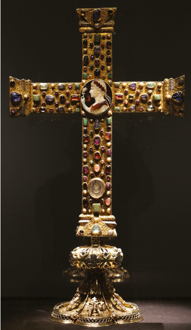
FIGURE 4.2 Cross of Lothair. Front side. 50 cm height, 38.5 cm width, 2.3 cm depth