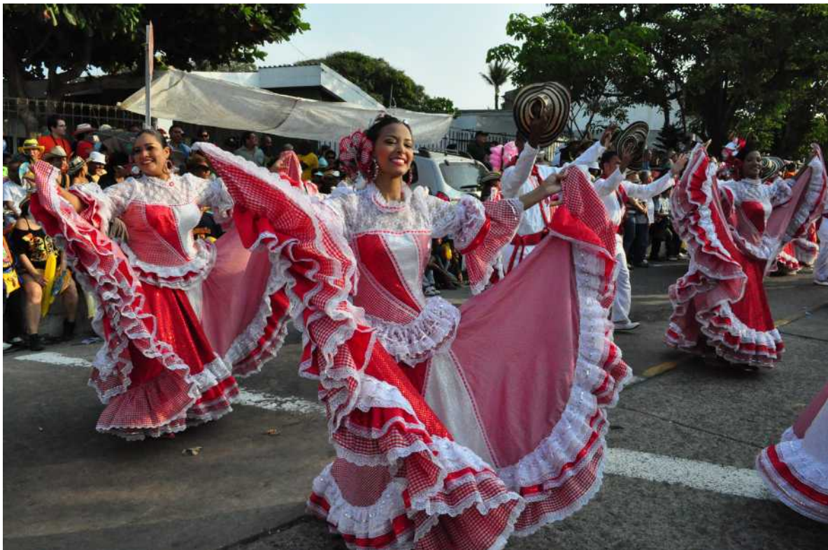
Fig. 2. Dance group. The women wear the traditional “polleras”. The men wear an outfit similar to that of the San Fermin festivities in Spain.