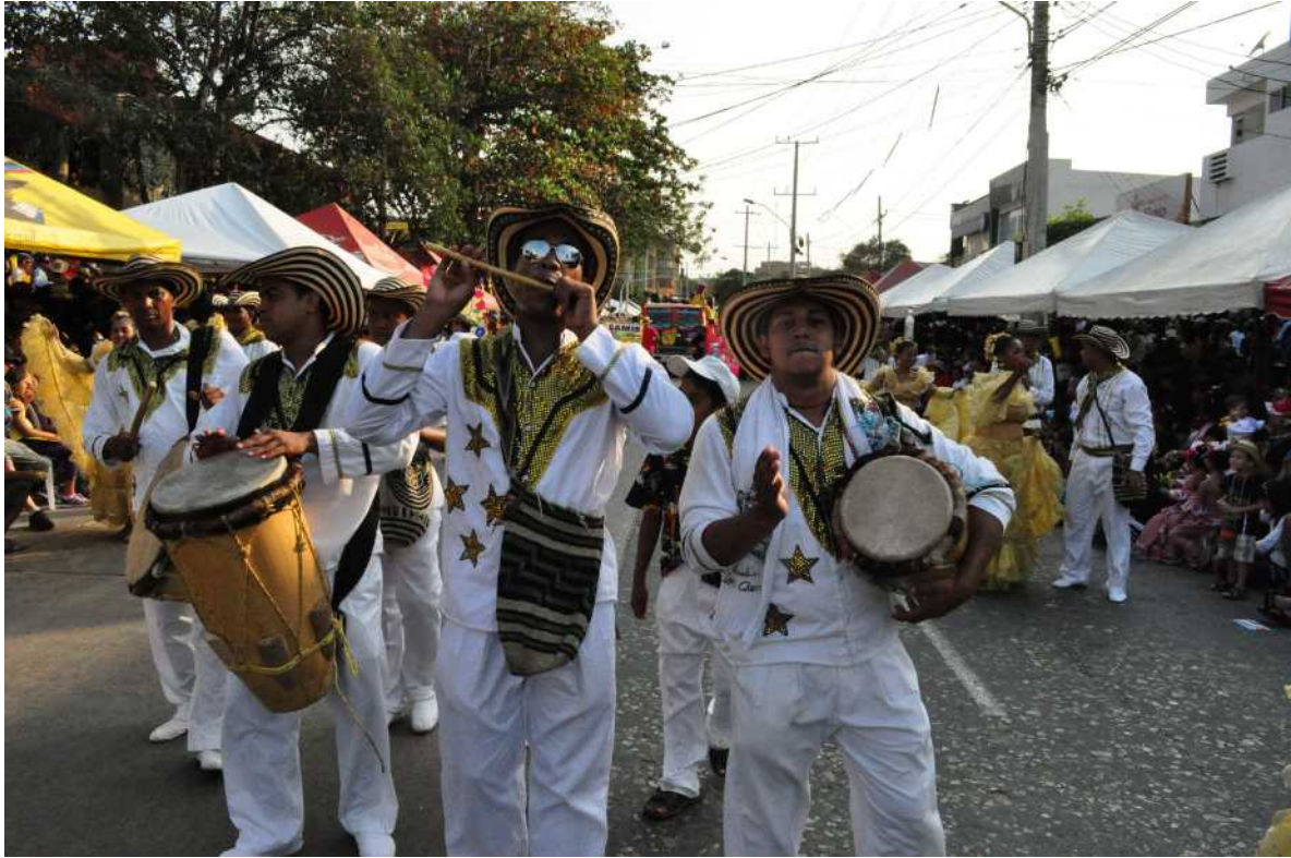
Fig. 1. Cumbia group in a parade with drummers and the leader playing the millo flute. 11