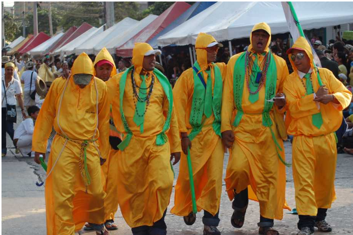
Fig. 4. A group of letanieros. Their letanias simulates, in a sarcastic way, the religious prayers typical of Catholicism using a vulgar language.