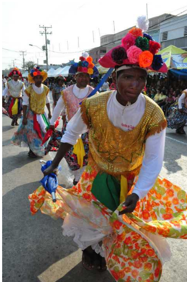
Fig. 5. Farotas. Group of men recalling the indigenous skill for camouflaging themselves as women to go unnoticed during battle.