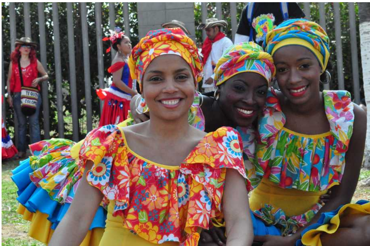
Fig. 3. Dancers in traditional attire of Afro-Colombian populations.