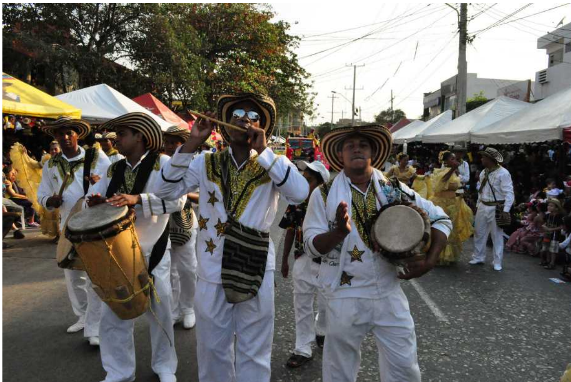
Fig. 1. Cumbia group in a parade with drummers and the leader playing the millo flute. 11