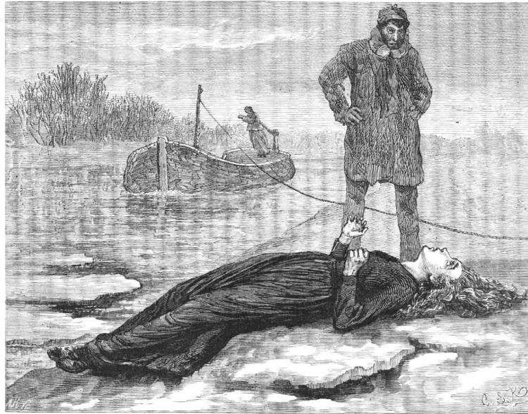
LOOKING OVER TOO, I SAW, LYING ON THE TOWING-PATH, WITH HER FACE TURNED UP TOWARD US, A WOMAN.