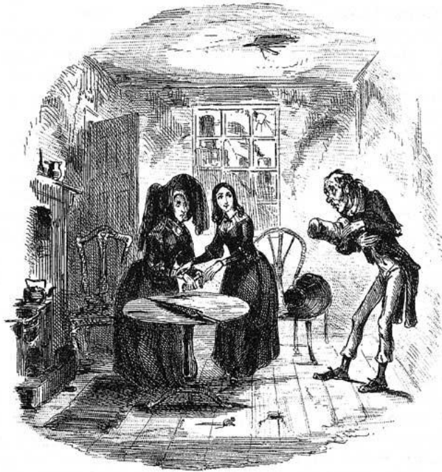
Newman Noggs leaves the lady in the empty house. (Browne, Hablot Knight, aka 'Phiz', 1839)

This is precisely this anxiety attached to the shabby genteel which Browne expresses through his illustration. The three characters in the foreground are depicted in a conventional posture, with Noggs obsequiously bending to the two ladies who, as may be seen from their attires, have probably known better days. However, the sense of perspective and the hatchings, both horizontal and oblique, trouble what could have been merely a domestic interior with characters respectful of the sense of decorum. The window does not open out onto any exterior vista but replicates the patterns on the walls inside and the cracks and fissures abolish the reassuring prospect of the house as a safe haven. The saturation of lines even arouses a sense of claustrophobia.