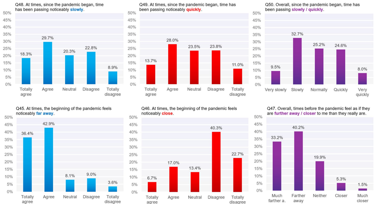
Figure 1. Distribution of PoT and TD questions within our sample.

the above grouping. We then performed multiple one-way ANOVA tests to determine the statistical significance between the groups based on each pair of means.