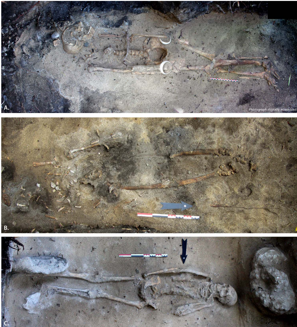
Fig. 4. Burials from Aniwa, all in extended position: (A) Burial 1 at Nakmaroro; (B) Burial 2 at Nakmaroro; (C) Burial 3 at Mission Terrace.

wall of the pit. A large block of coral measuring 50 cm long and 30 cm high that was situated about 20 cm above the skull probably contributed to the layout of the tomb, which was completed by a small fire feature (ca. 30 cm diameter) placed just above the feet and visible at 80 cm below surface.