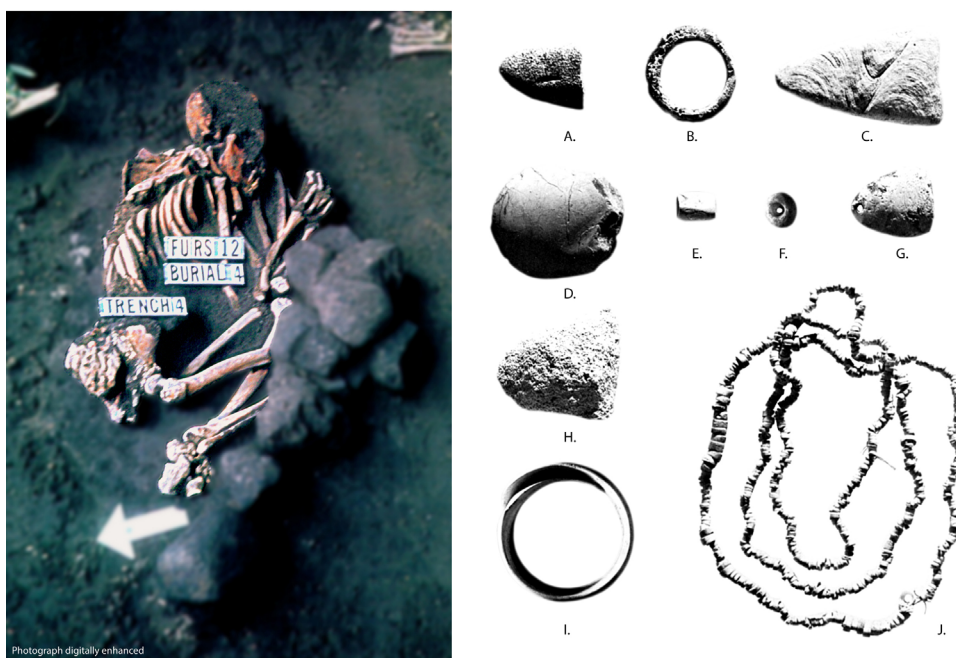
Fig. 6. Northeast Futuna Burial 4 at FURS12, showing skeleton in flexed position and stone arrangement (left); ornaments associated with burials at Futuna (right): (A) coral file from FU1A; (B) Conus ring pendant from FURS12, Burial 1; (C) Tridacna adze from FU1A; (D) shell adze from FURS12, Burial 12; (E) pig tooth bead from FURS9; (F) stone bead from FURS12; (G) shell pendant from FURS12, Burial 1; (H) coral file from FU1A; (I) Conus ring from FURS12, Burial 1; (J) small Conus beads from FURS12, Burial 8 (Shutler et al. 2002:197, plate 5) (illustration assembled by H. Goudiaby).

(FURS9, FURS10, FURS11) indicates more recent deaths toward the end of the second millennium A.D., around 300 cal. B.P. and later (Table 3). Finally, the single inhumation at FURS5, distinguished from the others by its extended position and absence of ornaments, provided a very recent date of post-1950 (Table 3).