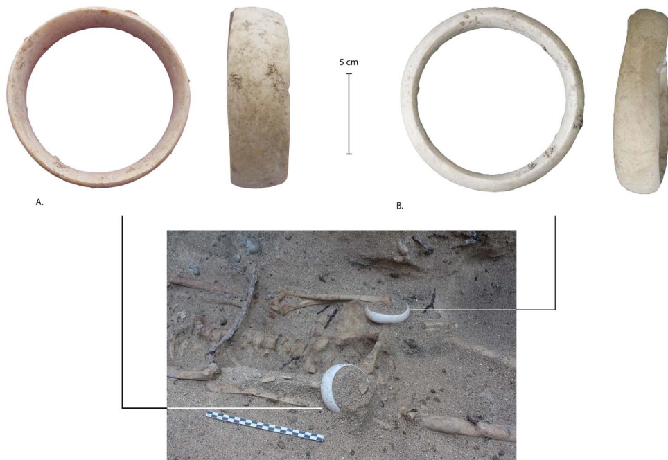
Fig. 5. Aniwa Burial 1 showing Tridacna sp. rings at each wrist: (A) right wrist ring; (B) left wrist ring.

Radiocarbon dating of one bone sample at Gogone indicates that burial events in that location occurred at the beginning of the second millennium A.D., ca. 1180–1050 cal. B.P. (Table 3). No direct dates have been obtained so far on the other burials at Nakmaroro and Mission Terrace. Burial 1 is probably as early as the Gogone individual and perhaps earlier, while Burial 2 would on stratigraphic grounds be slightly later. Burial 3 is likely to be earlier than those at Gogone and Nakmaroro. It had been buried in the ancient beach but further back from the edge of the terrace slope, and demonstrated very limited evidence of any soil accumulation at the time of burial. The earliest date for the cultural deposits sitting on top of the beach sand in these zones is 2500 B.P.