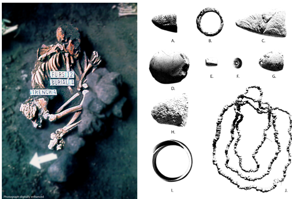
Fig. 6. Northeast Futuna Burial 4 at FURS12, showing skeleton in flexed position and stone arrangement (left); ornaments associated with burials at Futuna (right): (A) coral file from FU1A; (B) Conus ring pendant from FURS12, Burial 1; (C) Tridacna adze from FU1A; (D) shell adze from FURS12, Burial 12; (E) pig tooth bead from FURS9; (F) stone bead from FURS12; (G) shell pendant from FURS12, Burial 1; (H) coral file from FU1A; (I) Conus ring from FURS12, Burial 1; (J) small Conus beads from FURS12, Burial 8 (Shutler et al. 2002:197, plate 5) (illustration assembled by H. Goudiaby).

(FURS9, FURS10, FURS11) indicates more recent deaths toward the end of the second millennium A.D., around 300 cal. B.P. and later (Table 3). Finally, the single inhumation at FURS5, distinguished from the others by its extended position and absence of ornaments, provided a very recent date of post-1950 (Table 3).