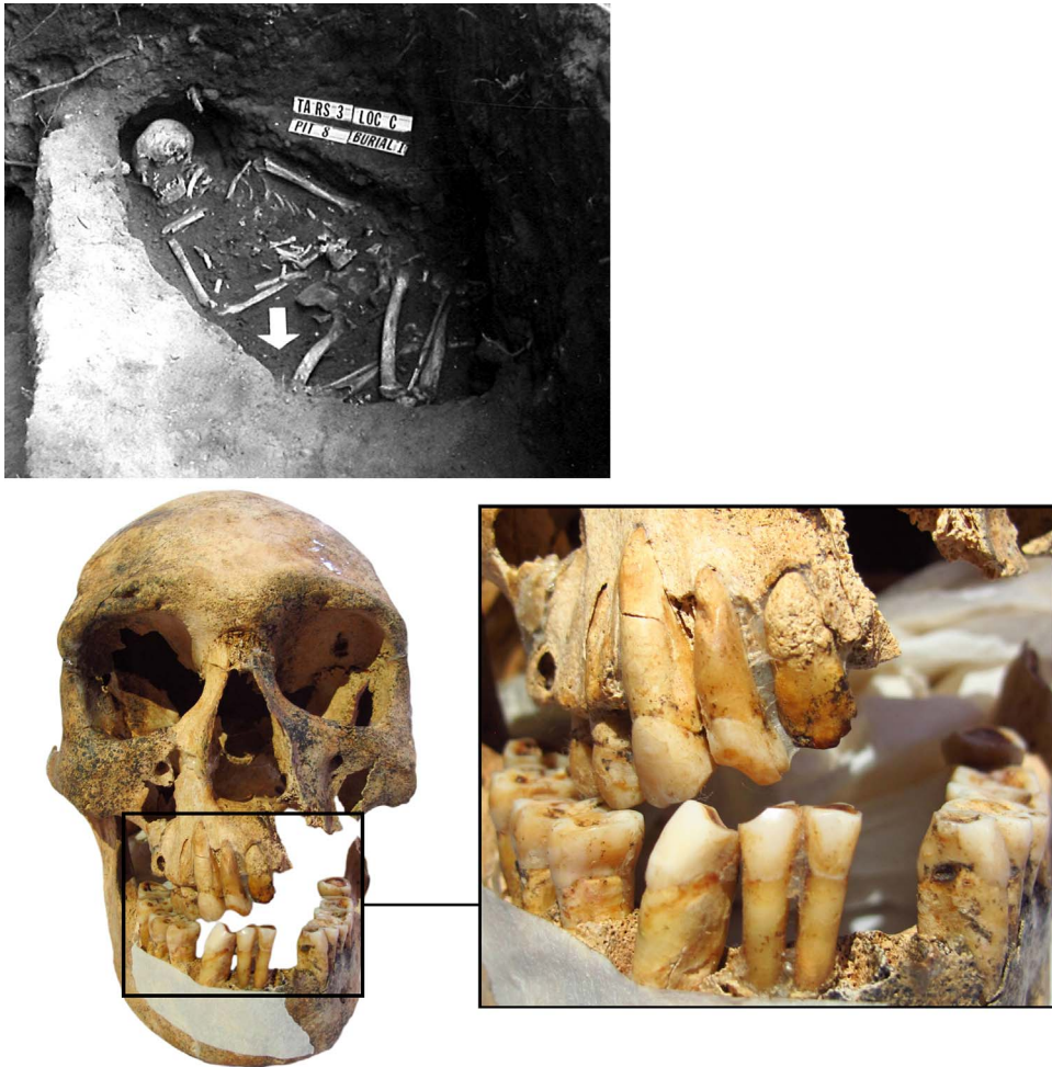
Fig. 2. Burial 1 at TARS3 site in southeast Tanna: remains in a flexed position (top left) (photo from Shutler Archives, used with permission from Vanuatu Cultural Center); skull showing dental wear due to pipe smoking (bottom left) (photo by A. Fenwick); detail of worn dentition (bottom right) (photo by A. Fenwick) (illustration assembled by H. Goudiaby).

Direct dating of the TARS1 Burial 1 individual was obtained in 1965 at Gakushuin Laboratory, with a result dating to 1818–1314 B.P. ( 1650 \pm 100 B.P. Gak-757) that is now considered to be unreliable by current standards (Shutler Archives; Shutler et al. 2002). Consequently, new direct dating was undertaken on individuals from TARS1 and TARS3 (Table 3), with successful results for TARS3 Burial 1 returning a recent date of between 260 and 0 cal. B.P. (Posth et al. 2018).