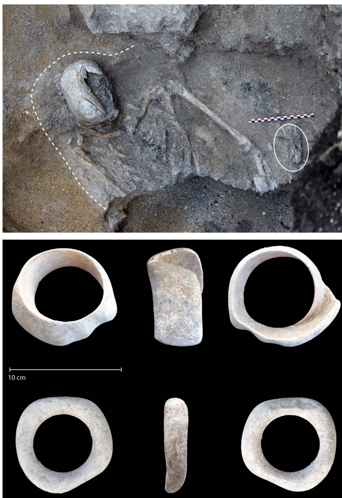
Fig. 3. Burial 1 at Enarapap site in northwest Tanna (top), showing feet (encircled) on left side of the body; ornaments (bottom) including rings made of Tridacna sp. (upper) and Stombus sp. (lower).

The Enarapap individual, an adult, was deposited in a pit, with the head located in the west. It was resting on its back with the upper limbs on the sides, left hand by the pelvis, and lower limbs highly flexed, knees towards the right side and feet close to the pelvis in a position that is similar to that of the TARS3 burial (Fig. 3). The decomposing body parts were progressively replaced by gray sand resulting in the maintenance of the anatomical coherence of the skeleton. Constraining effects, indicated by the position of the skull showing its upper aspect and the placement of the