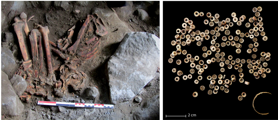
Fig. 7. Northeast Futuna Burial 1 at FURS15, showing skeleton in a contracted position (left); associated ornaments, including small Conus sp. beads and a turtle shell ring (right).

arms had been placed along the trunk and the forearms between the legs. The right elbow was slightly bent, hand under the left leg resting on the right ankle and the left elbow bent at 90^\circ on the abdomen, hand under the left knee. Ruptures of joints visible at the right knee, left elbow, left knee, and between the bones of the left leg suggest a decomposition of the body in an empty space and the possible use of a flexible envelope to wrap the corpse.