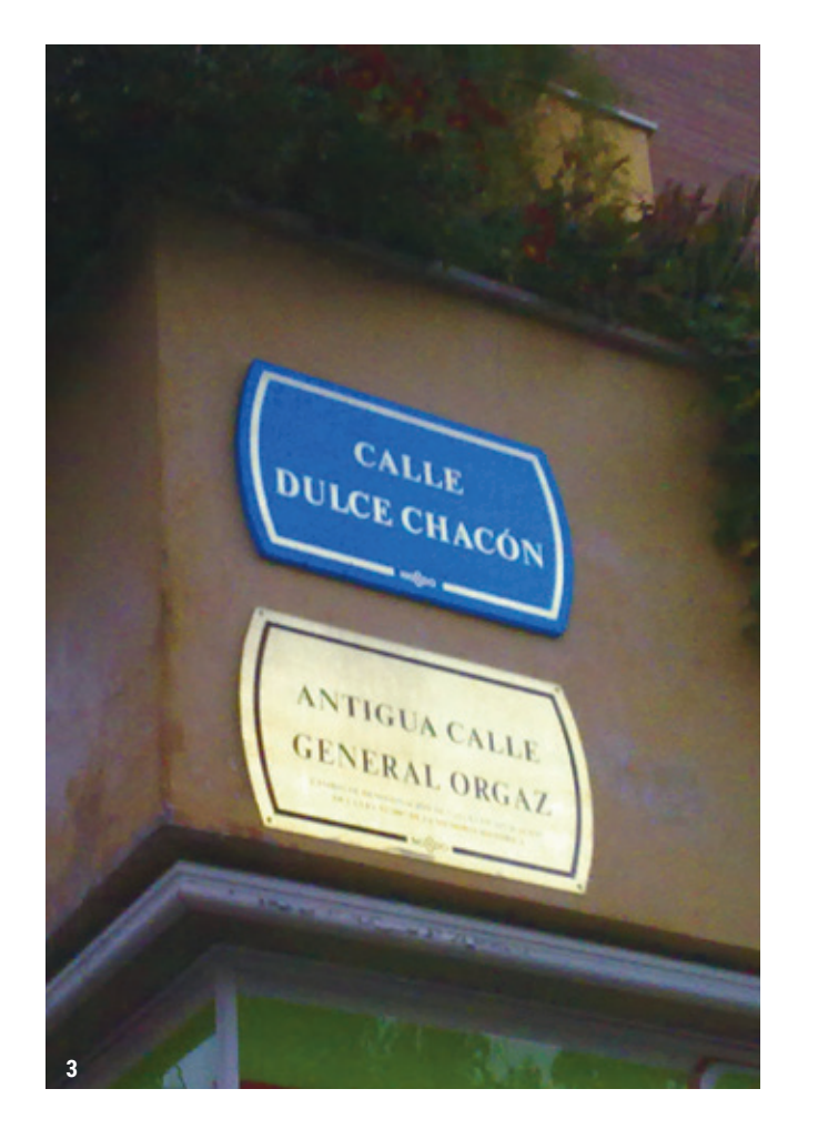
3. Street sign in Seville showing the name change and clarifying that the old name has been eliminated in application of the Historical Memory Law

Over the long term, the proliferation of memory laws adopted in Europe in the late 20th century marks a difference in legal traditions specific to States, historically divided between civil law and common law. The common law tradition, which characterises the United Kingdom and the countries of its former colonies on different continents such as the United States, favours judicial decisions to establish the norm and regulate social relations. These countries are not familiar with the phenomenon of memory laws, or only on a very