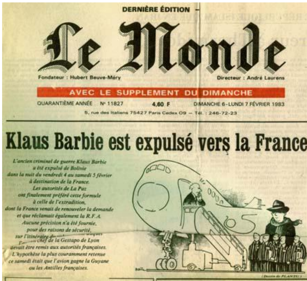
Le Monde , February 6-7, 1983

the others, standing behind them. Next to the cartoon, the newspaper's commentary begins, "The war criminal Klaus Barbie: expelled from Bolivia" 20 .