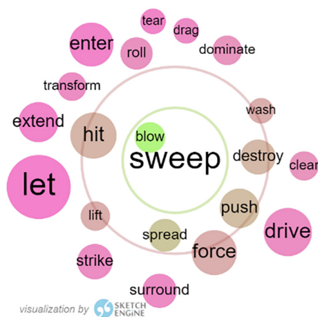
Fig. 1: Thesaurus of sweep in the OEC

Figure 1 shows the thesaurus of the highly frequent verb sweep followed by collexemes of sweep in lexicogrammatical positions in the OEC. The synonym candidates are based on the similarity of collocational behaviour and compared frequency: as figure 1 shows sweep is associated mainly with the metaphorical sense of hit , blow , destroy , push , spread . There are however few very close candidates, indicating that sweep appears to play a central role in the lexicon (as a potential foundation word).