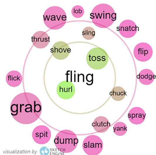
Fig. 5: Thesaurus of fling in the OEC

The thesaurus for fling in Figure 5 shows a number of lexemes with similar collocational behaviours, toss, hurl, swing, grab dump .