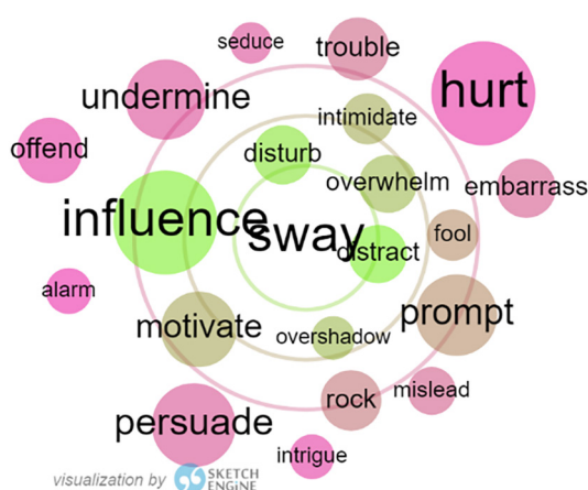
Fig. 3: Thesaurus of sway in the OEC

With 13,325 tokens, the verb sway has a number of polysemic extensions that do not correlate with sound symbolic associations; instead candidates with similar collocational behaviour coincide with a metaphoric sense of sway , such as intimidate , persuade , prompt , influence (see fig. 3).