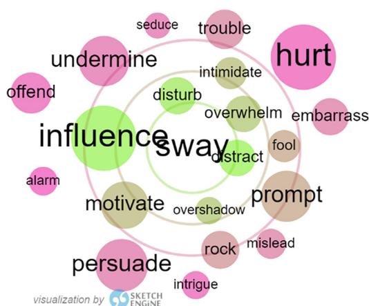
Fig. 3: Thesaurus of sway in the OEC

With 13,325 tokens, the verb sway has a number of polysemic extensions that do not correlate with sound symbolic associations; instead candidates with similar collocational behaviour coincide with a metaphoric sense of sway , such as intimidate , persuade , prompt , influence (see fig. 3).