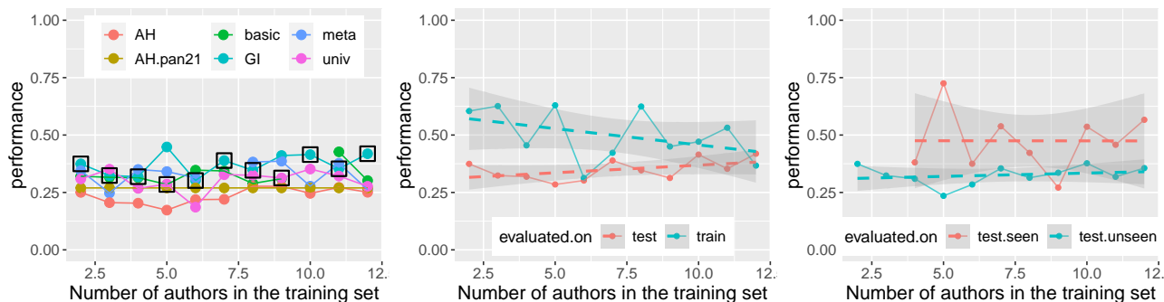
Figure 4: Performance by number of distinct authors in the training set. See the explanations about the different graphs in the caption of fig. 1. Note: the number of authors starts at 4 in the test set because there are not enough distinct documents by author to satisfy the conditions (contant size of the test set, balance between positive and negative cases) with less than 4 authors.

in order. This means that more distinct books are added at every increment for the low values in number of authors than for the high values.