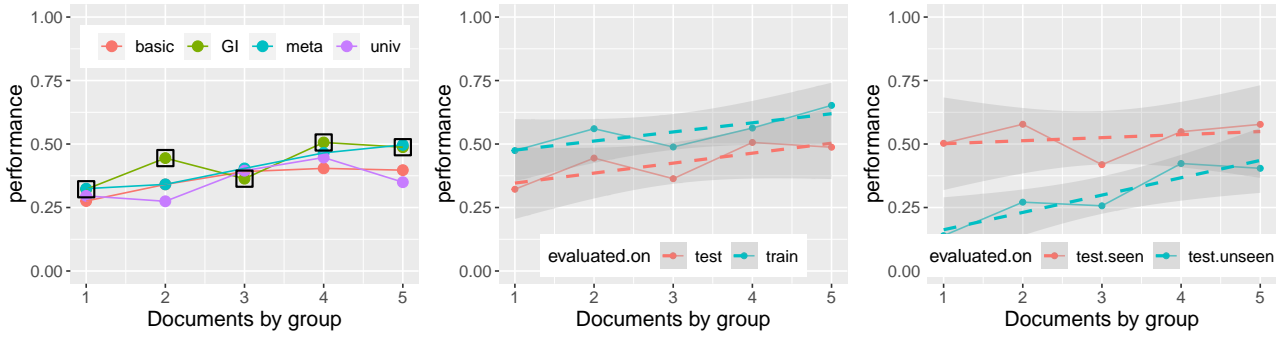
Figure 2: Performance by group size. See the explanations about the different graphs in the caption of fig. 1. The AH and AH.pan21 baseline systems are not included in this experiment because the AdHominem/O2D2 is designed only for pairs of single documents (see section 4.3).