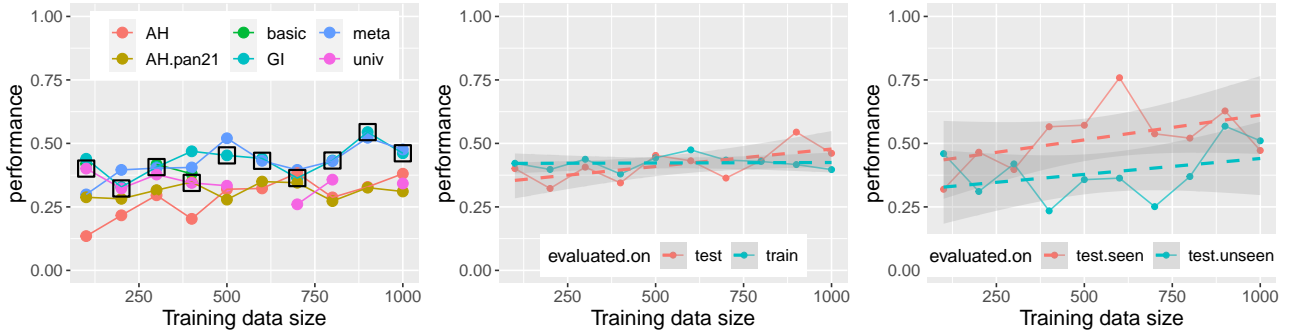
Figure 3: Performance by number of problems in the training set. See the explanations about the different graphs in the caption of fig. 1.

This experiment examines the role of the number of problems in the training set. A high number of instances is likely to reduce the risk of overfitting. The test set is once again made of 100 instances without any duplicate book, while the training set contains a varying number of instances in which books are picked with replacement. Both the training and test set instances are made of a single document by group and the positive/negative cases are balanced. All the documents are 100 lines long. It is also worth noting that the training process is much longer when the number of instances in the training set is large.