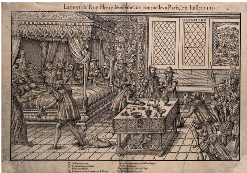
FIGURE 1 King Henry II of France on his deathbed, with members of the royal family and the royal household in attendance. Woodcut.

Keeping multiple layers of mediation in mind, Catholic funerary sermons could be systematically re-examined too, as well as visual depictions of the scene of death. 30 Likewise, libraries and archives are full of reports, penned by physicians and surgeons, of the “last illness and death” of distinguished persons. Admittedly, in Catholic Europe these reports generally concern only high-rank ecclesiastics, aristocrats and, of course, popes and royals, so it is no surprise that their agony was attended by medical staff (see Figure 1). 31 Still,