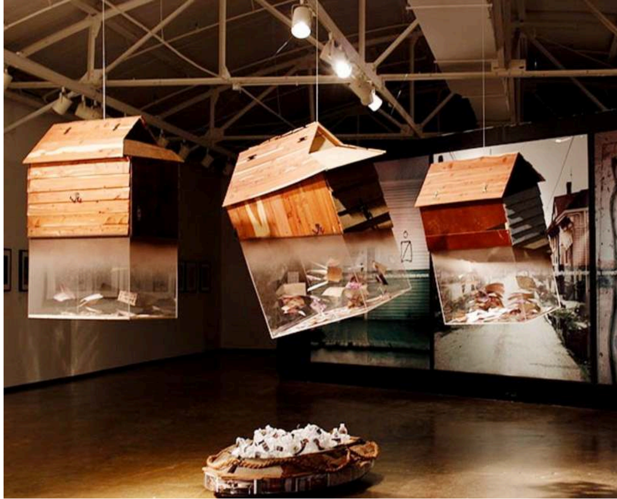
→ Things that Float , Rontherin Ratliff, 2010, New Orleans