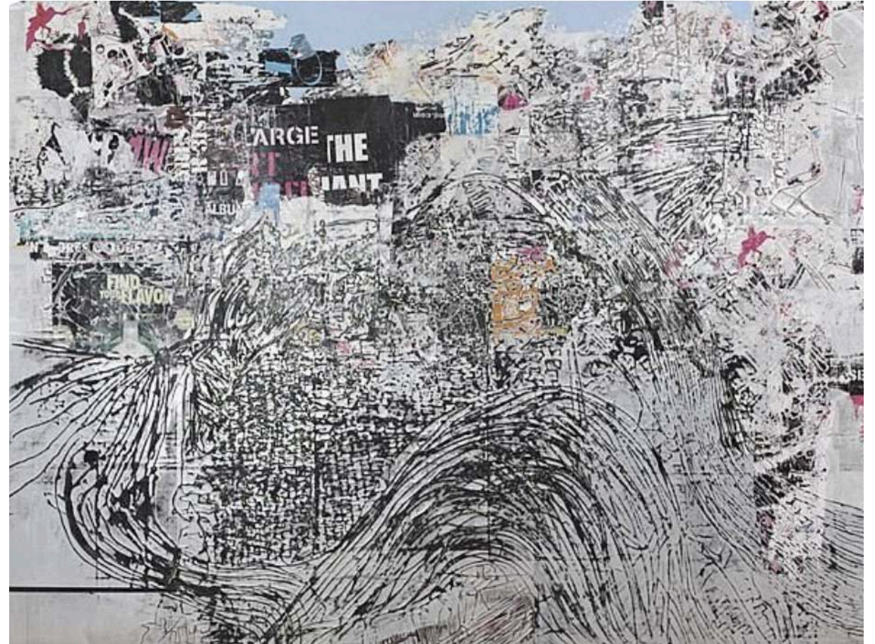
→ Noah's Third Day , Mark Bradford, 2007 Mixed media on canvas.