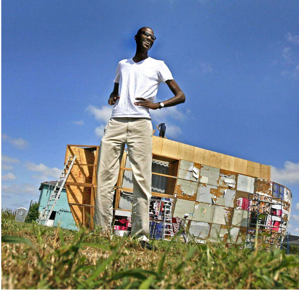
→ Mark Bradford assembling Mithra in Lower Ninth for Prospect 1, New Orleans