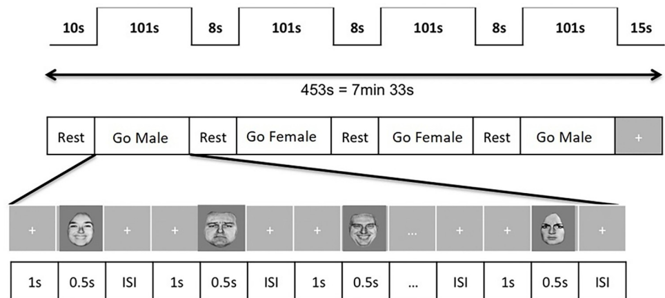
Fig 4. Emotional Go / No go sequence scheme. ISI: random time interval (2 to 6 seconds).

https://doi.org/10.1371/journal.pone.0262216.g004