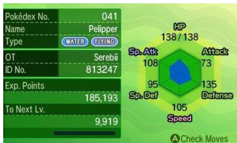
Figure 1. Picture of a stats screen of a pokémon, Pelipper, in Pokémon Ultra Sun . His nature is “Jolly”, which lowers his Special Attack (Sp. Atk) by 10% and boosts its Speed by 10%, as suggested by the colors in which they are written.

to online calculators 15 . In the recent games, some Non-Playable Characters (NPC) give hints about IVs, although one needs to know such values exist in order to understand what the NPC is talking about. Some other features are not completely hidden but not explicit either, such as “nature”. Pokémons can be of one of 24 natures, 4 of which are “neutral”. The 20 other natures give a 10% boost to one battle characteristic 16 and reduces another one by the same amount (Hit Points are not affected by nature). This feature is not explicitly explained in the video games and players usually learn this in the fan websites and communities. The recent games give hints about the effects of natures in the User Interface. The boosted stat is written in red and the lowered one in blue (Figure 1). However, the interviews revealed, not surprisingly, that only those who already know about the mechanics behind the “nature”, realize what the colored stats mean, and some do not even realize they are differently colored. Pokémon is already too vast for a player to know everything about it by simply playing and passively consuming products. Such game design features make it even more important for players to engage more intensively, and online participation is the most common way to further one’s knowledge about the games thanks to the resources provided by fans.