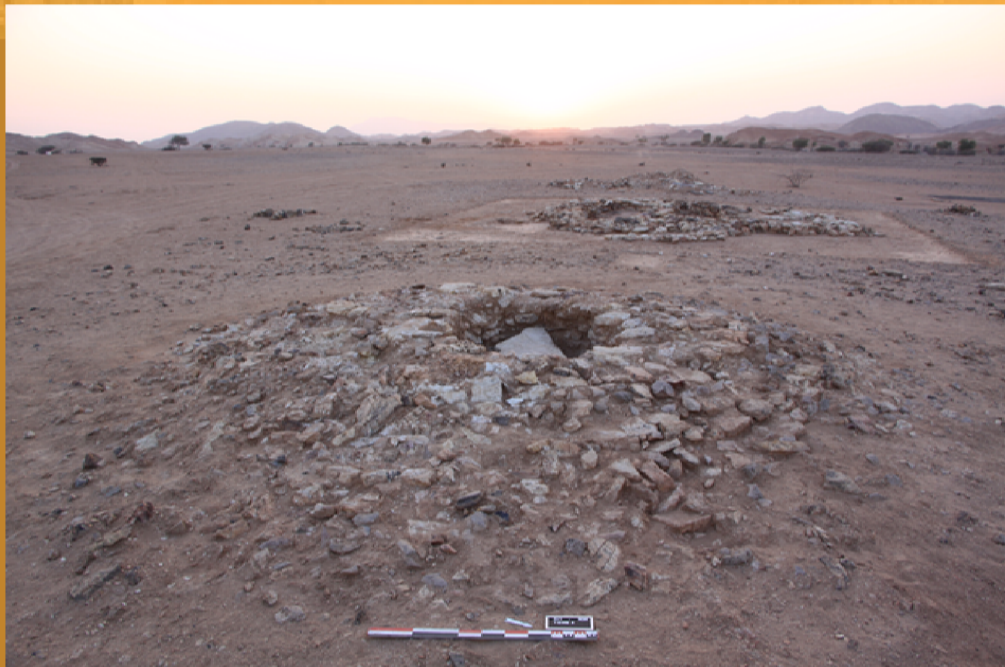
Grave 4, southern group (3300-29000 cal. B.C.)

The excavations led since 2018 on the site of Khor Jarama, in Oman's Ja'alan, have revealed the construction of the first monumental tombs known in the region (3500-2900 cal. BC), associated by new burial custom including livestock species, due to the regional traditions which communities usually value marine or mangrove resources (malacofauna, marine mammals and fishes).