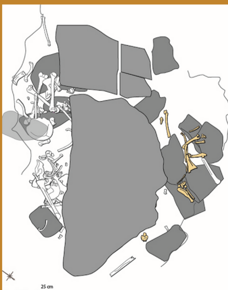
Erratic human/animal bones scattered around the massive slab (animals bones in yellow, grave 4).