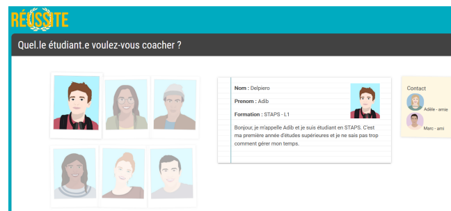
Fig. 1. A library of virtual students can be coached

The game proposes to embody a coach and guide different profiles of first-generation students during their first six weeks at the University (see Fig. 1). The coach's mission consists in making suggestion to the virtual student in order to help him/her to organize her/his academic work and globally observe good daily living habits. The virtual student is a non-player character which is controlled by an artificial intelligence. During a game session, the virtual student is subject to daily life events that cannot be foreseen such as sickness, legal obligations or loss of their credit card, academic duties, and solicitations such as an invitation to a party or invitation to his/her cousin's wedding. The player is supposed to guide the virtual student and gives him/her advice through a virtual mobile phone. He/she also can suggest to schedule academic duties, sport activities, housework etc to their personal agenda once it has been synchronized with the academic one (see Fig. 2).