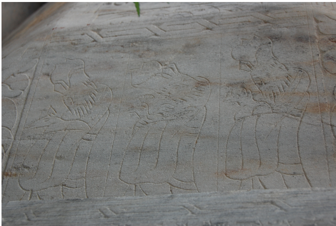
fig. 2. Lun Boyan's entombed epitaph - Detail of the stone cover

The text of the entombed epitaph opens with a reference to the foreign origins of the recipient: "Very far in the extreme West, the steep lands, the spacious territory of mountains [...]" 98 Nevertheless, there is no mention of the events of the Tibetan Empire or of the relationships between the Tang and the Tibetan court. It is also interesting to note that the author evokes the western lands in very general terms