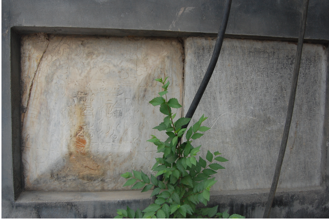
fig. 1. Lun Boyan's entombed epitaph