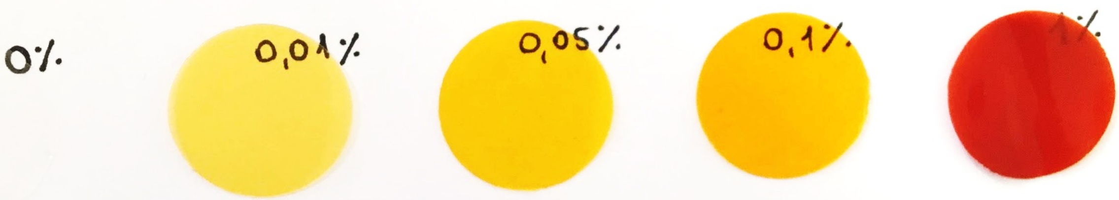
Figure 1. PLA films produced with different bixin concentrations (0 – 1%)

✓ The presence of bixin reduced the light transmission of PLA films (Figure 2): the higher the concentration of bixin, the higher the films' barrier to ultraviolet (200–300 nm) and visible light (300–800 nm). The conjugated double bonds in bixin molecular structure serve as chromophore moieties, being responsible for its light absorption capacity.