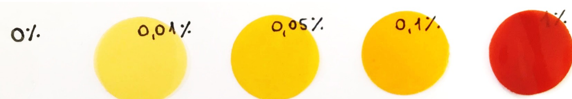
Figure 1. PLA films produced with different bixin concentrations (0 – 1%)