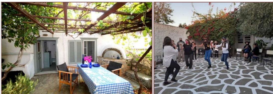
Figure 5: Hellenic settings in Argentina

The same is observed in the garden of the Hellenic Association of Ingeniero White, where the descendants recreate a little piece of Greece through plants: Santa Rita, malvones and olive trees occupy a preferential place, with limestone in open areas, where dancing and musical performances occur on holidays.